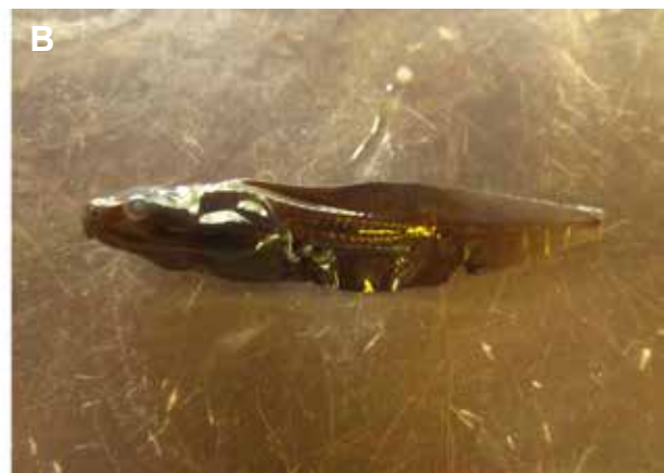
Fig. 2. A) ABHabs P-2.1 with empty egg mass; B) Tadpole of Cruziohyala craspedopus (preserved).