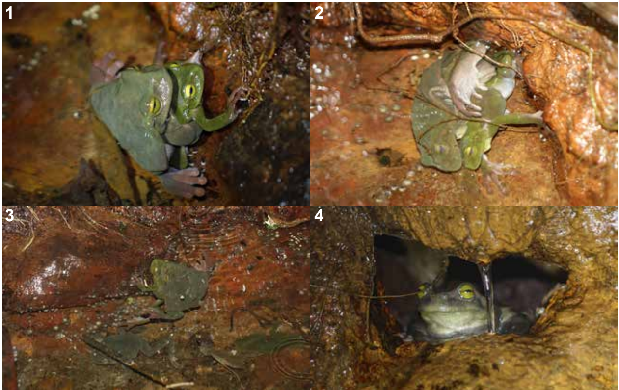
Fig. 1. Aquatic axillary amplexus of Plectrohyla avia . (Right top). Photo by César L. Barrio-Amorós. Fig. 2. Male of Plectrohyla avia grasping the female's head with its long and curved teeth. (Left top). Photo by César L. Barrio-Amorós. Fig. 3. Amplectant pair of Plectrohyla avia , two motionless males and eggs over the pool. (Bottom left). Photo by César L. Barrio-Amorós. Fig. 4. Reproductive male of Plectrohyla avia inside a hole on the waterfall side, from where it calls. (Bottom right). Photo by César L. Barrio-Amorós.