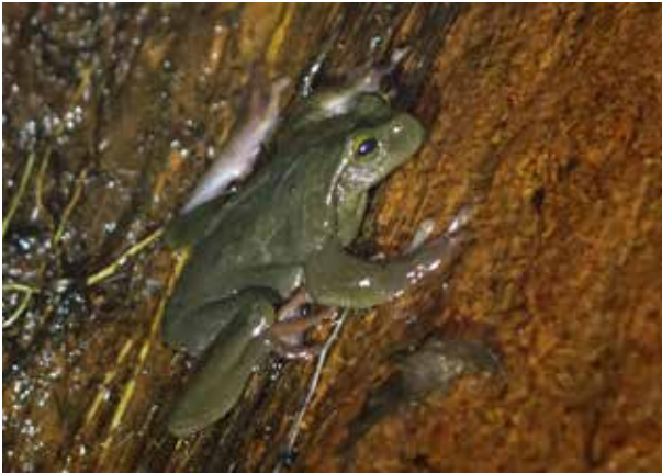
Fig. 5. Active male of Plectrohyla avia on a waterfall wall, the only male we saw outside the water or holes.

one amplexant pair) and we cannot be sure to which species the eggs belong. Only unpigmented eggs have been reported for Plectrohyla (Duellman and Campbell 1992). An alternative explanation could be that the larger unpigmented eggs belong to different stages of development of the same species.