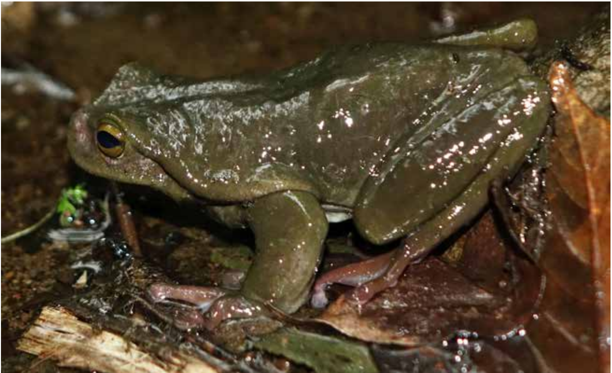
Fig. 9. Lateral view of a reproductive male MZFC 29273, showing the lateral skin folds.