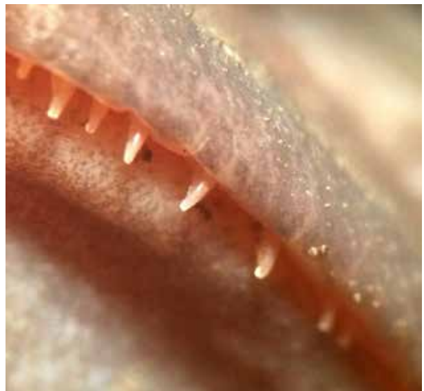
Fig. 8. Detail of the long and curved teeth protruding from the upper maxilla of a preserved reproductive male MZFC 29273.

In the same ravine, many Plectrohyla cf. sagorum were heard and seen, including one amplexant pair. This species is smaller (males up to 45.5 mm, females up to 51.9 mm; Kohler 2010) and no individual was observed in the water; several males were calling from rocks facing the ravine, and an amplexant pair was on the wall of a small waterfall. In a nearby larger stream, with many P. matudai (including recent metamorphs) but not P. avia , we found four Plectrohyla hartwegi , close to a four m high waterfall, all were perched on stems and ferns in or close to, the spray zone. This species has very flared lips but no protruding teeth.