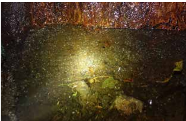
Fig. 10. Pool full of eggs in different stages of Plectrohyla avia .

In less than two hours we saw eight Plectrohyla avia in a section of less than 20 m in the ravine. At the small pool and inside the holes in the wall of the canyon were many eggs attached to the rock or stems, some freshly laid, some with white embryos visible, and already some tadpoles recently hatched (Fig 10). We cannot be absolutely sure that all those eggs belong to P. avia , as we never saw females laying. This species, however, was the dominant in that sector of the ravine and occupied the lower pool (five individuals using the pool for reproductive purposes), and though no adults were seen in the upper pool (Fig. 10), two adult males were very close. On the upper pool only unpigmented eggs were seen, very likely belonging to P. avia .