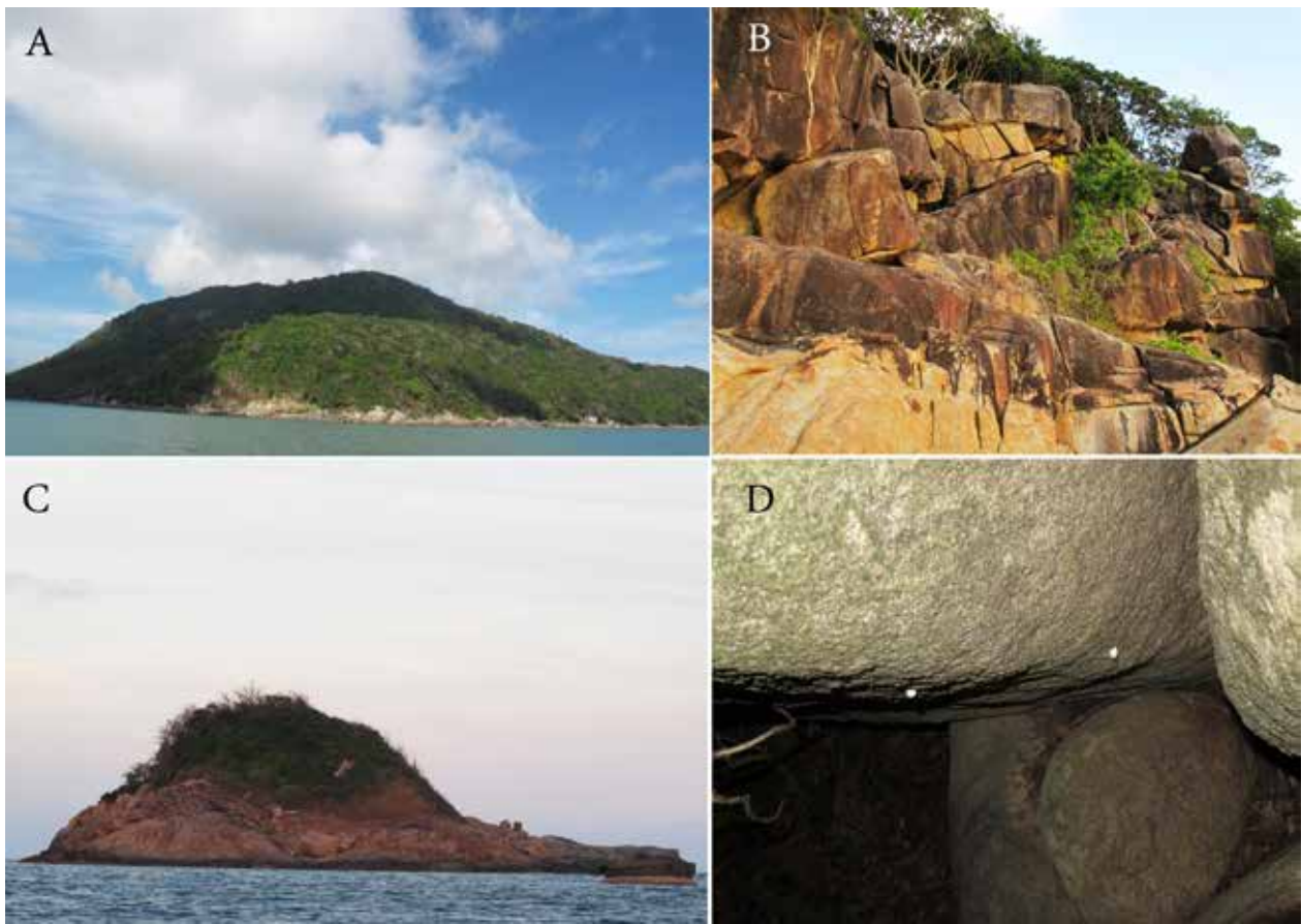
Fig. 1. Habitat of Cnemaspis psychedelica . A. Hon Khoai Island; B. Microhabitat on Hon Khoai; C. Hon Tuong Island; D. Deposited eggs on Hon Tuong Island.

Basic knowledge on the current population status of C. psychedelica , its ecology and potential threats are still lacking, as it is the case for most lizard species in the region. To better understand the threat level of a species, population size estimations provide essential baseline information and are thus crucial for wildlife management strategies and the assessment of the conservation status of populations and species (Ngo et al. 2016; Reed et al. 2003; Traill et al. 2007). The present study aims to provide the first assessment of the population size of C. psychedelica as well as an evaluation of potential threats, in particular human impacts, in order to assess its conservation status and develop adequate conservation strategies. We further investigated seasonal variation in population size and structure by conducting field surveys both during the wet and dry seasons. In addition, we surveyed another, smaller offshore island in proximity to Hon Khoai to investigate potential occurrence of the species to assess its distribution range.