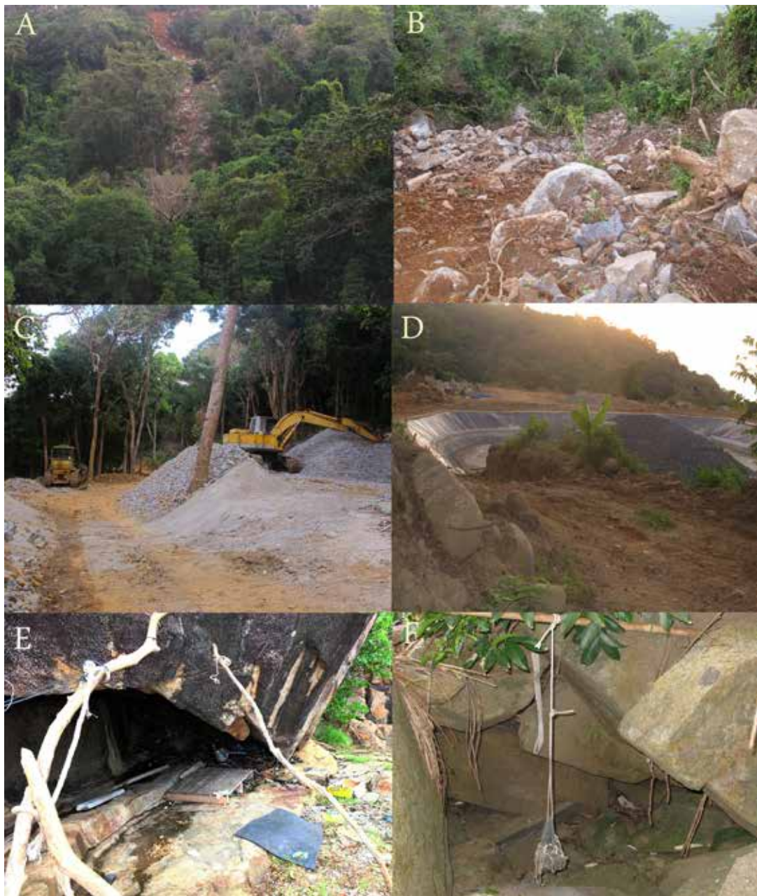
Fig. 4. Potential threats to Cnemaspis psychedelica . A. Erosion caused by opening of new ways; B. Forest opening and blasting of granite karst formations; C. Building of new roads; D. Building of artificial ponds to store freshwater; E. Camp of a fisherman living on the island; F. Trap for Monitor lizards.

to the island is generally prohibited (e.g., Altherr 2014; Auliya et al. 2016; Nguyen et al. 2015).