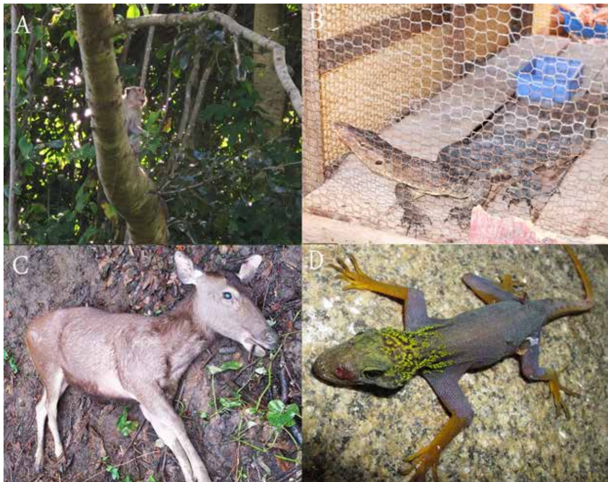
Fig. 5. A. Introduced macaque on Hon Khoai Island; B. Trapped Water Monitor Lizard for consumption; C. Deer killed by blasting of granite outcrops; D. Naturally occurring but injured C. psychedelica . Photos H.N. Ngo.

The present population estimation suggests a stable and actively reproducing population of C. psychedelica at least on Hon Khoai Island. While densities of the species at untouched sites were found to generally have increased from wet to dry season, we observed a decrease of the individual number in the areas, which were most strongly affected by habitat degradation. We assume that the current habitat destruction as well as the planned development of ecotourism will probably interfere with C. psychedelica natural populations, because the species was found to flee hastily in response to the presence of humans. Touristic activities and the presence of humans were already found to negatively affect other range restricted lizards such as Shinisaurus crocodilurus or Goniurosaurus species in northern Vietnam (Ngo et al. 2016; van Schingen et al. 2015). Regarding the small size of Hon Khoai Island, the availability of remaining alternative sites for C. psychedelica is limited. Since the species was only discovered in 2010, long-term population data is lacking and long-term consequences of habitat alteration are not yet investigated in detail.