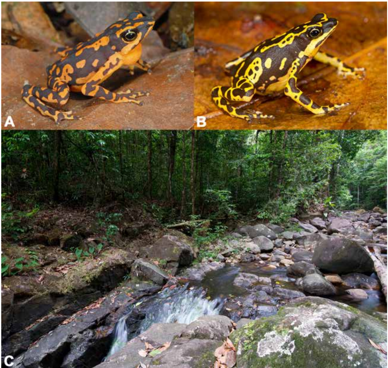
Fig. 1. (A) Orange and (B) Yellow color morphs of Atelopus hoogmoedi , both encountered at the studied locality in the Iwokrama Mountains, Guyana. (C) Typical breeding habitat of A. hoogmoedi in the Iwokrama Mountains.

in the north of the reserve and 1,400 mm in the south of the reserve (MPFITRF 2009). Wet season usually extends from May to August and again from November to February (MPFITRF 2009), although this has seemed more irregular in recent years, especially during El Niño events (reported as particularly strong in 2015, and the months of November and December 2015 were very dry in Iwokrama).