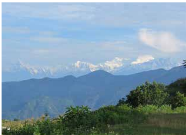
Fig. 3. Habitat of Liopeltis rappi at Dhodeni, Kabilas, Chitwan.

into towns. The present record of the dead specimen from cultivated land tends to show the possible ignorance of local people in the survival of the species. Thapa (2016) recorded five specimens from Palpa, of which four were found killed by local people and a single live specimen from Khaliban. People in this area kill snakes at the moment they encounter them as standard practice in the culture. This rampant killing of snakes, including L. rappi by local people, is an observed threat in the CHAL. All snakes are believed by the local people to be venomous despite the fact that only 17 species of snakes in Nepal are venomous (Sharma et al. 2013). Outreach activities among farmers, local communities, in schools, and colleges should focus on the good ecosystem function of snakes and basic identification tools of snakes would be instrumental in better protecting the snake fauna of the CHAL. Our finding indicates that a countrywide detailed herpetological survey would be beneficial to better understand the ecology, distribution pattern, threats, and conservation status of L. rappi in Nepal.