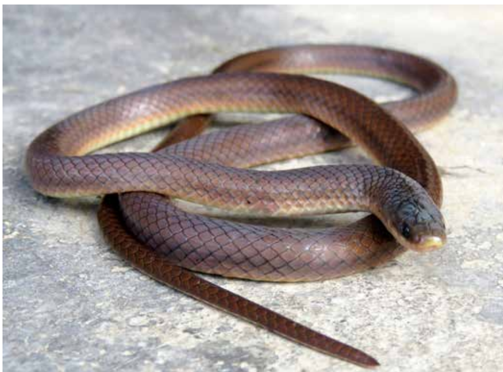
Fig. 1. Liopeltis rappi from Dhodeni, Kabilas, Chitwan.