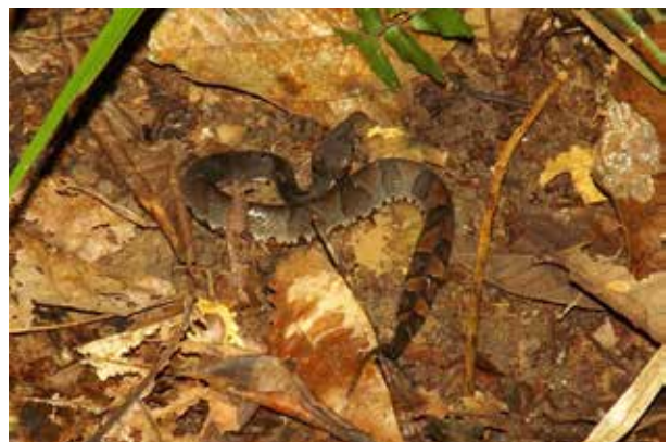
Fig. 3. Adult Bothrocophias hyoprora (UF 157255) from Altamira, Pará, Brazil.