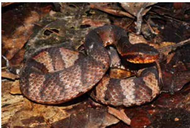
Fig. 2. Adult Bothrocophias hyoprora (INPA-H 33106) from Canutama, Amazonas, Brazil.