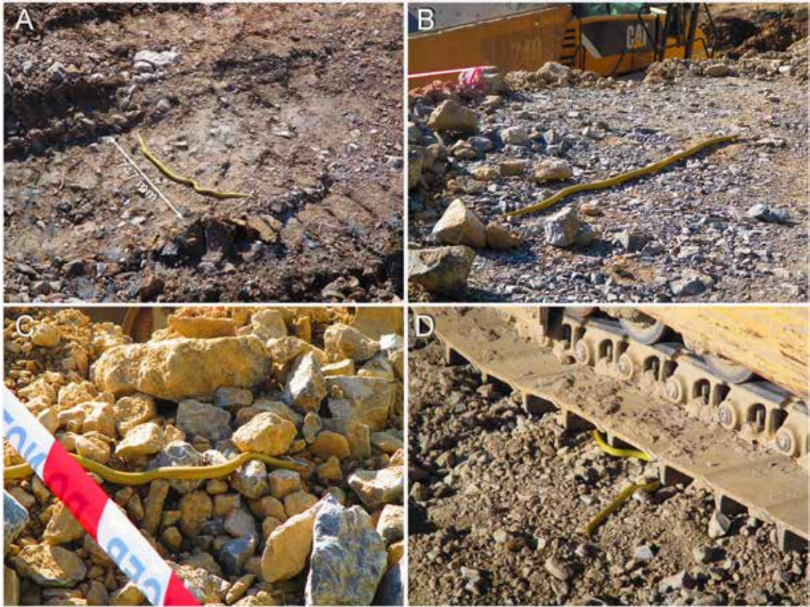
Fig. 2. The first live individual of Toxicocalamus ernstmayri , observed and photographed in broad daylight at the Ok Tedi Mine, North Fly District, Western Province, Papua New Guinea. (A) The individual's serendipitous crossing of a 747 mm wide tire track allowed an approximation of its total length as near 850 mm. (B) The snake moves in a straight line across open ground. (C) Slower movement across a rubble pile allowed a more detailed examination of head and body scales (see Fig. 4). (D) The individual moving under the tracks of a stationary digger.

body. At an SVL > 750 mm total length this individual of T. ernstmayri would appear to be a subadult, as it is considerably shorter than the holotype (SVL 1,200 mm). The encounter with an unusual, “golden” snake at the Ok Tedi Mine was sufficiently noteworthy, even in Papua New Guinea where snake encounters are commonplace, that it was presented in the mine's own magazine ( Ok Tedi Weng magazine, Issue 1, 2017, p. 6).