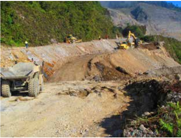
Fig. 3. View of an actively worked area of the Ok Tedi Mine. The observed individual of Toxicocalamus ernstmayri eventually disappeared into the vegetation on the slope in the top left of the photograph.

lation center, the town of Tabubil which was established to support the mine, yet the mine lies over 1.2 km higher. Tabubil, located at only 457 m elevation, is approximately 450 km from the coast. The steepness of the southern Star Mountains, rising by 1,200 m in elevation over only 12 km in horizontal distance, contrasts with the almost imperceptible south-north increase in elevation (< 500 m over 450 km) of the Trans-Fly Region as a whole.