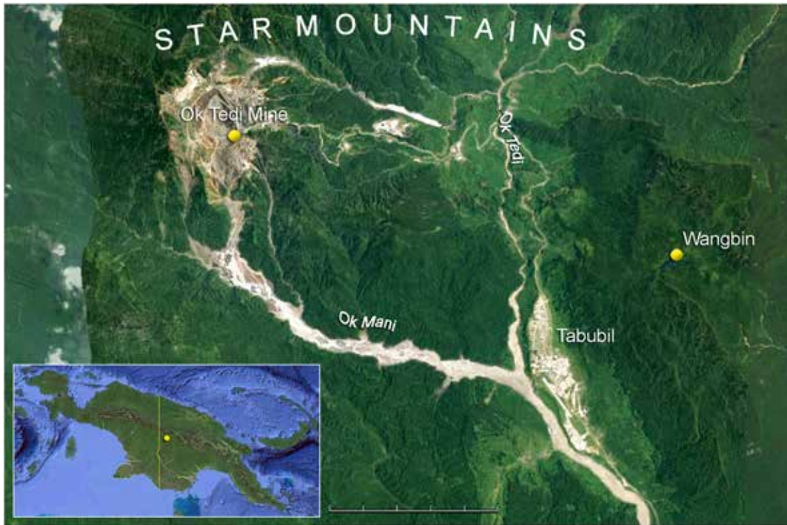
Fig. 1. Satellite map (derived from Google Earth) of the southern Star Mountains, North Fly District, Western Province, Papua New Guinea, with yellow dots on the larger map indicating two localities (Wangbin and Ok Tedi Mine), approximately 13 km apart, where Toxicocalamus ernstmayri has been recorded. The main town is Tabubil at the confluence of the Ok Tedi and Ok Mani, which flow into the Fly River. Scale = 5 km. The inset map illustrates the location of the larger map in relationship to the rest of New Guinea.

2015, as it crawled across an area of active mine workings along the west wall at the Ok Tedi Mine ( 5^{\circ}12'53.77''S , 141^{\circ}08'38.57''E , elev. 1,670 m) approximately 13.2 km WNW of Wangbin, in the North Fly District where the holotype was collected (Fig. 1). It was observed for approximately 20 min and photographed several times.