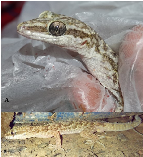
Fig. 2. Cyrtopodion himalayanus (A) Enlarged lateral view of head. (B) Full lateral view of the body.