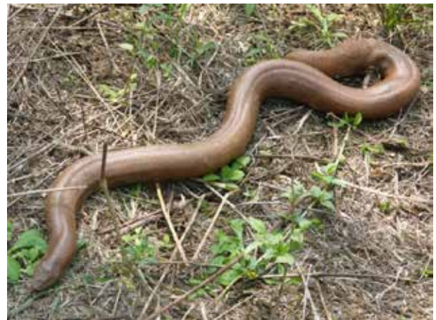
Fig. 2L. Red Sand Boa Eryx johnii .