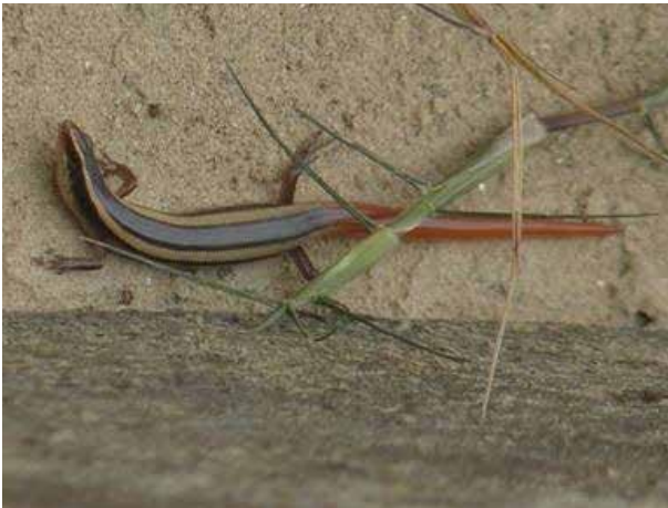
Fig. 2I. Common Keeled Skink Eutropis carinata .