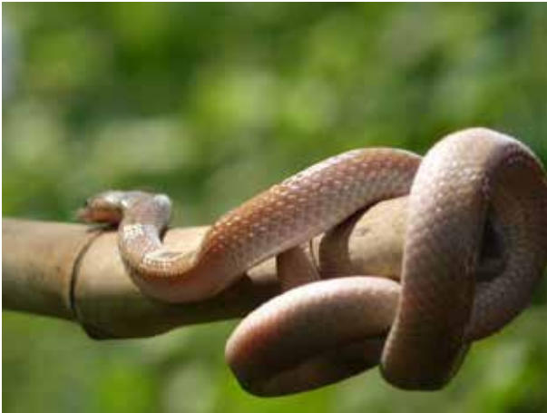
Fig. 2M. Indian Ratsnake Ptyas mucosa .