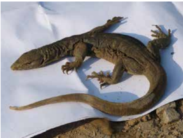
Fig. 2K. Bengal Monitor Varanus bengalensis .