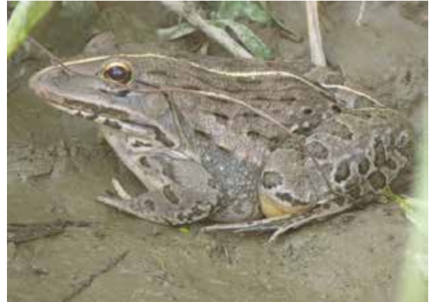
Fig. 2B. Hoplobatrachus tigerinus .