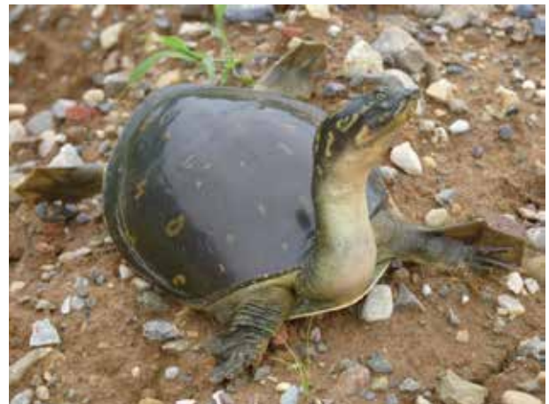
Fig. 2F. Indian Flapshell Turtle Lissemys punctata .