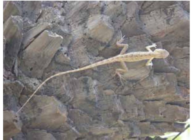
Fig. 2H. Indian Garden Lizard Calotes versicolor .