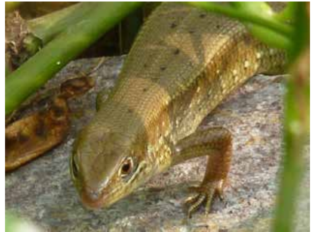
Fig. 2J. Spotted Supple Skink Lygosoma punctata .