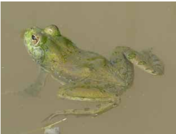
Fig. 2C. Skittering Frog Euphlyctis cyanophlyctis .