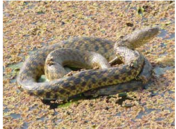
Fig. 2N. Checkered Keelback Xenochrophis piscator .