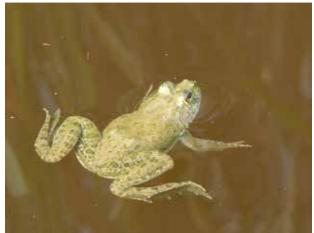
Fig. 2D. Skittering Frog Euphlyctis cyanophlyctis .