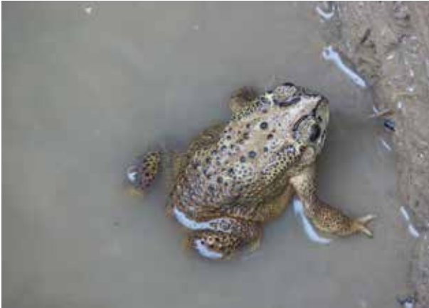
Fig. 2A. Asian Common Toad Duttaphrynus melanostictus .