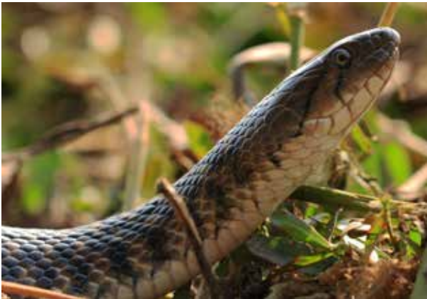
Fig. 2O. Checkered Keelback Xenochrophis piscator .

and Bengal Monitor Varanus bengalensis were seen occasionally in the study area. Among snakes, Checkered Keelback Xenochrophis piscator was recorded very often in the edges of wetland habitat followed by Red Sand Boa Eryx johnii , which was seen occasionally in woodland habitat, whereas Common Wolf Snake Lycodon aulicus , Common Indian Krait Bungarus caeruleus , and Spectacled Cobra Naja naja were recorded seen rarely during the study period. Among reptiles, turtles were mostly documented in the edges of wetland, marshland, and occasionally in grassland habitats, whereas other reptiles, including lizards and snakes, were recorded in woodland and grassland habitats in the study area.