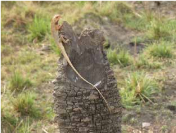
Fig. 2G. Indian Garden Lizard Calotes versicolor .