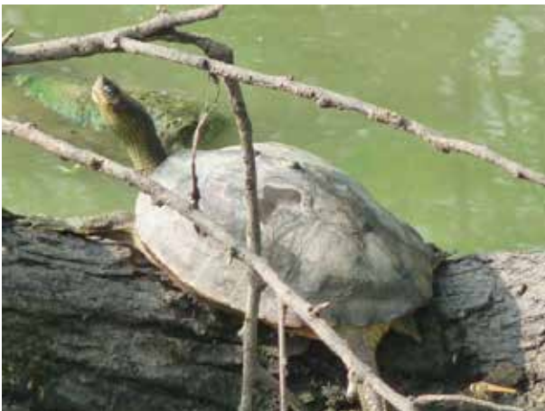
Fig. 2E. Indian Roofed Turtle Pangshura tectum .