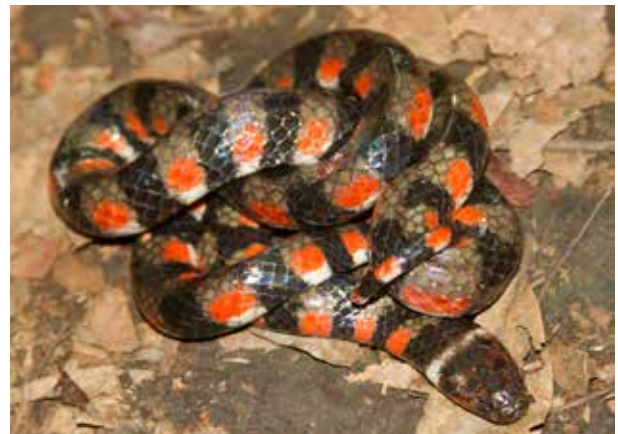
Fig. 1. Hydrops triangularis (MUSA 4749) collected at Pampas del Heath National Sanctuary, Madre de Dios region, Peru.