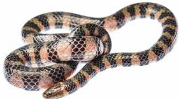
Fig. 2. Hydrops triangularis (photographic voucher Nbr. PERU2016_5732) recorded at Los Amigos Biological Station, Madre de Dios, Peru.