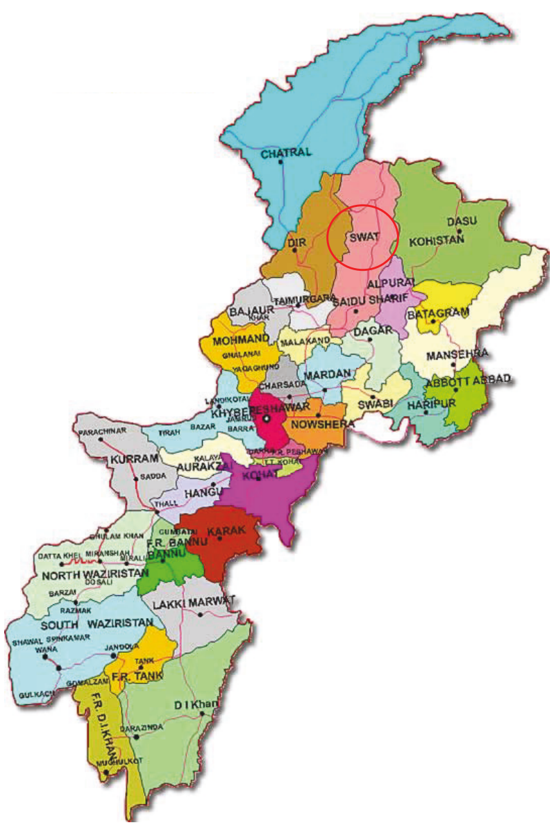
Fig. 1. Map of Khyber Pakhtunkhwa, red circle shows the study area in the District Swat within the province.