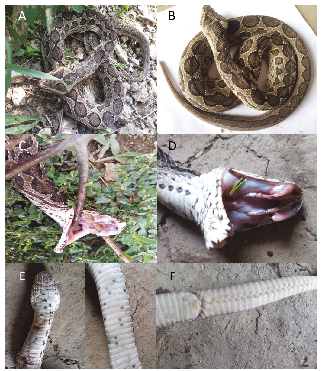
Fig. 3. Photos of the dead Daboia russelii specimens from Gujjar village Miandam, Swat, KP, Pakistan. (A, B) Dorsal views, (C, D) Fangs, (E) Black spots on ventral side, (F) Anal orifice with tail showing a zip-like structure.

Russell's Vipers from four localities in the study area, including two specimens each from Dhoop, Chhar, and Karoo, and one specimen from Kalandori Gujjar Village Miandam, Swat, Pakistan. Russell's Viper is one of the most widespread of Asiatic venomous snakes. While surveying the literature no published records for this species are available in Swat Valley, Pakistan. Therefore, the present study documents the presence of this species in the hilly areas of Swat Valley.