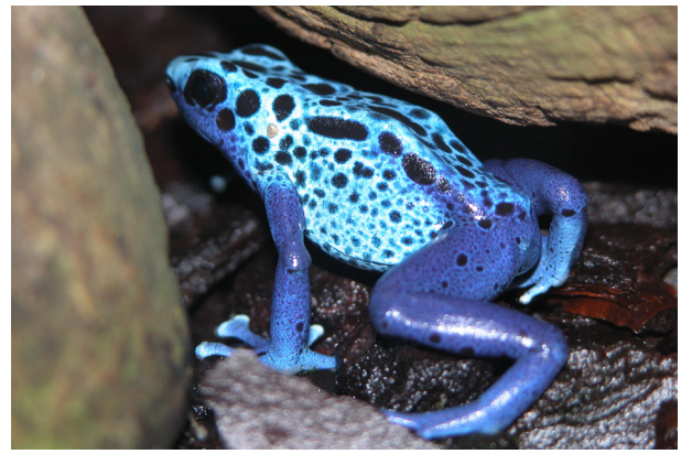
Fig. 1. Dendrobates “azureus” (= tinctorius ).

1968: Hoogmoed (1969a,b) discovered populations of D. “azureus” in four forest islands in the middle of the Sipaliwini savanna near the Vier Gebroeders Mountain