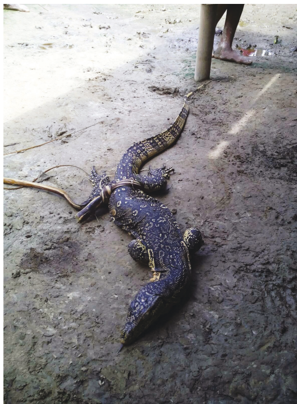
Fig. 3. A Common Water Monitor ( Varanus salvator ) killed for venturing into a human habitation at Rongpur 6, Hailakandi. It was subsequently buried.

from the base of the tail of the lizard, called Shandar tel ('Oil of the Monitor lizard' in the local language), is used as a sexual lubricant by man. Although the Bengali community people, who are the majority in the present study area, do not consume the lizard themselves, they catch any individuals that venture into the settlements and sell them to the tribes. A moderate sized individual may cost up to 1,000–1,500 INR (~14–21 USD), while the oil is sold at the rate of 500 INR/L (~7 USD).