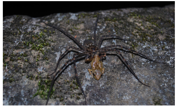
Fig. 2. Record of predation of Pristimantis savagei by Trechalea sp., in a sector of Piedemonte, Villavicencio-Meta, Colombia.