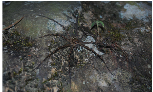
Fig. 3. Warning stance of the spider Trechalea sp. The individual was on a rock at an approximate height of 150 cm, less than 1 m from the water source.