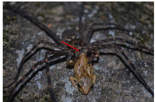
Fig. 4. Trechalea sp. individual secreting its digestive juices.

Other aspects of importance for the predatory event of Trechalea sp. on Pristimantis savagei are the anthropogenic stressors witnessed in the study area (habitat loss and fragmentation), because these have been reported to impact, in either a positive or negative way, the interspecific interactions and lead to imbalances in the natural system (Mahecha-J and Díaz-S 2015).