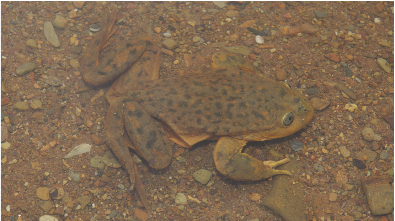
Fig. 1. Adult male of Telmatobius rubigo in its natural habitat in the locality of Santa Catalina, Jujuy province, Argentina.

de Los Pozuelos basin (Barrionuevo and Abdala 2018; Barrionuevo and Baldo 2009). This fully aquatic frog has a unique feeding behavior among anurans, using a specialized feeding mechanism of inertial suction to capture their prey (Barrionuevo 2016). Beyond this singular prey capture mechanism, the knowledge about the trophic ecology of this species remains incomplete.