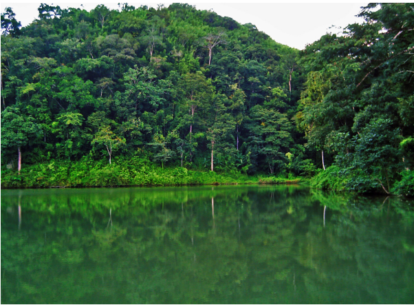
Fig. 4. View of the natural habitats of Oligodon catenatus in Tam Dil National Wetland.