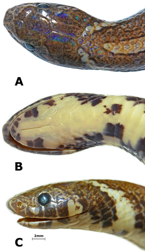
Fig. 1. Head of Oligodon catenatus in dorsal (A), ventral (B), and lateral (C) views.

scute is excluded from the number of subcaudals. Morphometric characters and pholidosis measurements are given in Table 1.