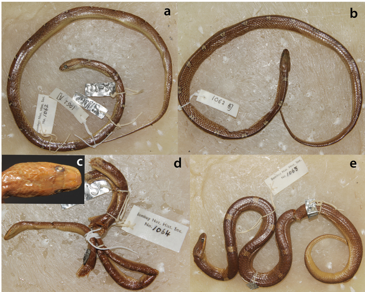
Fig. 4. Extralimital records re-identified as (a–b) Lycodon anamallensis (BNHS 1602a and b) and (c–e) Lycodon cf. aulicus (BNHS 1603 and 1604).

Like most members of the genus, this species is usually nocturnal, as the four active individuals were sighted at night during fieldwork. At least the juveniles are semi-arboreal, and have been seen twice climbing trees and building walls, similar to the habits of some Lycodon species and especially Dryocalamus species (Smith 1943). Potential prey species (pers. obs. in other Lycodon species) recorded in the vicinity of these snakes are: Cnemaspis graniticola in Horsley Hills that were sleeping on the same building wall; and Hemiphyllodactylus jnana in Melagiri Hills, that were seen on plants near roadsides (also see Agarwal et al. 2019, 2020).