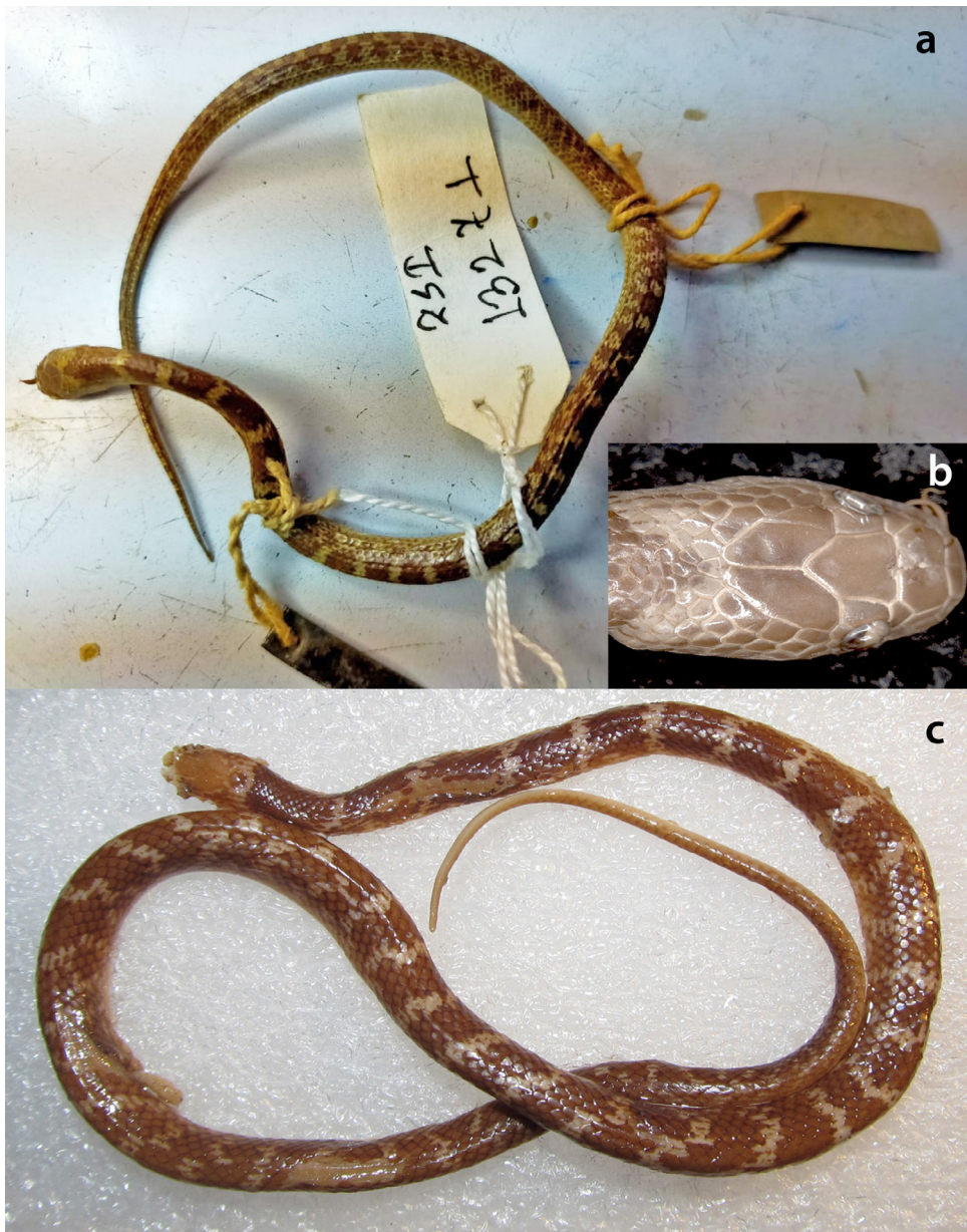
Fig. 2. Lycodon deccanensis sp. nov. in preservative: (a–b) entire and head closeup (inset) of Paratype ZSI 13271; (c) entire view of SACON/VR-93.

frontal (preocular separating frontal, prefrontal, and supraocular in one case); dorsum brown in adults and black in juveniles, with white cross bars.