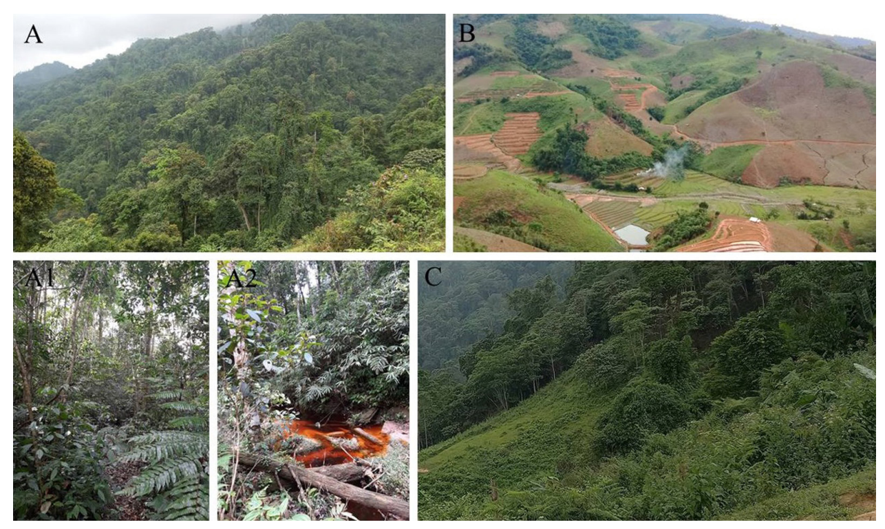
Fig. 2. Habitat types in Xuan Nha Nature Reserve, Vietnam: (A, A1, A2) Evergreen forest, (B) Agricultural areas, and (C) Disturbed secondary forest.

ethyl acetate (Simmon 2002), fixed in 80% ethanol, and then transferred to 70% ethanol for permanent storage. Some road-killed specimens were also collected for morphological examination. These specimens were subsequently deposited in the collection of the Tay Bac University (TBU), Son La Province, Vietnam.