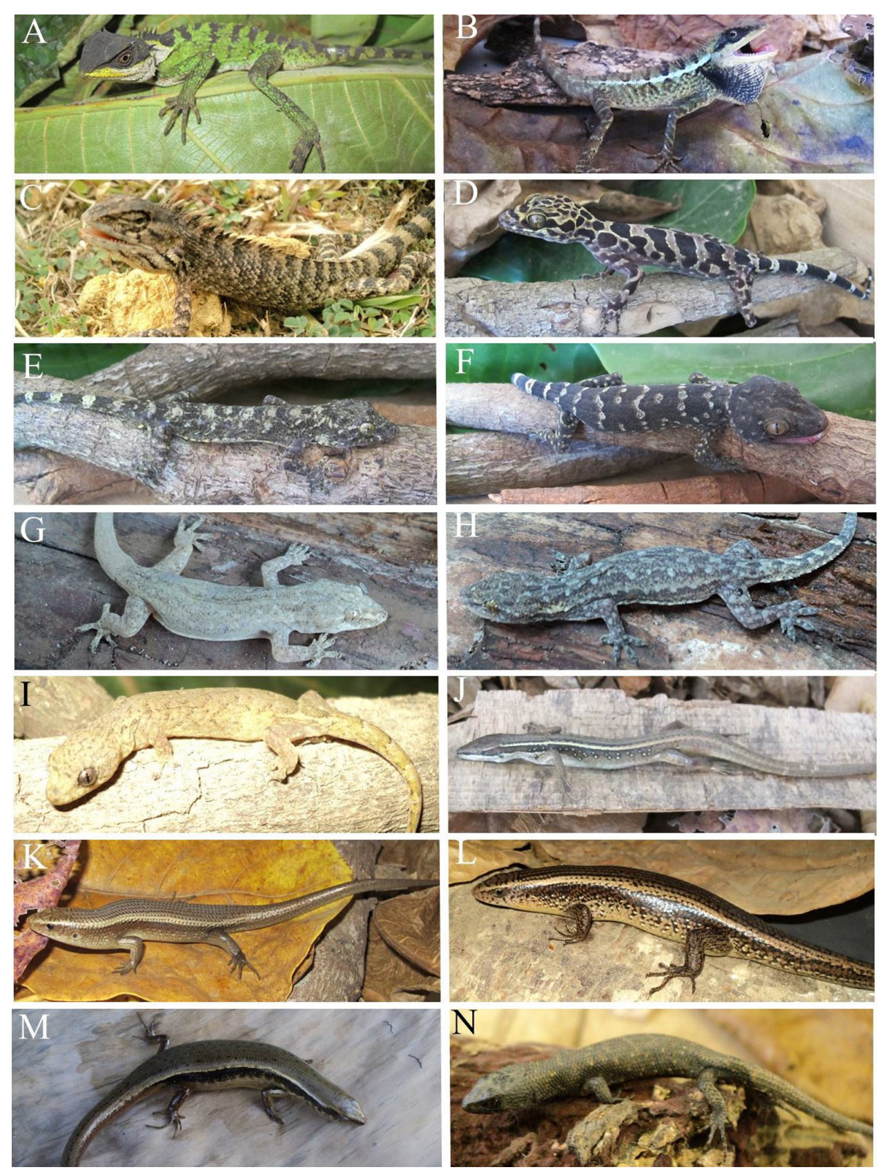
Fig. 5. Lizard species recorded in Xuan Nha Nature Reserve, Vietnam: (A) Acanthosaura lepidogaster, (B) Calotes emma, (C) C. versicolor, (D) Cyrtodactylus otai, (E) Gekko palmatus, (F) G. reevesii, (G) Hemidactylus frenatus, (H) H. garnotii, (I) Hemiphyllodactylus bonkowskii, (J) Takydromus sexlineatus, (K) Eutropis longicaudatus, (L) E. multifasciatus, (M) Sphenomorphus indicus, and (N) Tropidophorus baviensis.