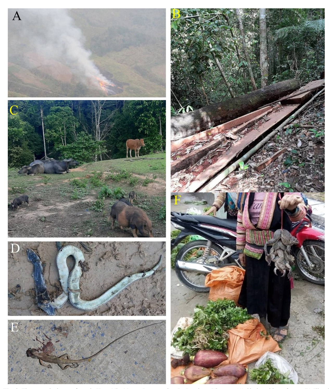
Fig. 8. Threats to the herpetofauna in Xuan Nha Nature Reserve, Son La Province, Vietnam: (A) Slash and burn forest, (B) Illegal timber logging, (C) Domestic animal production in the forest, (D, E) Road-killed reptiles and amphibians on the road, and (F) Wildlife collection for food and trade.

Several of the records provided by Nguyen et al. (2010) were excluded from the list of Xuan Nha NR in this study, either because they were based on misidentifications or due to changes in taxonomy and/or nomenclature. For example, Leptobrachella pelodytoides was formerly reported from the nature reserve, but has since been assigned to a different taxon, and L. pelodytoides is considered to be restricted to Myanmar, southern China, and Thailand (Frost