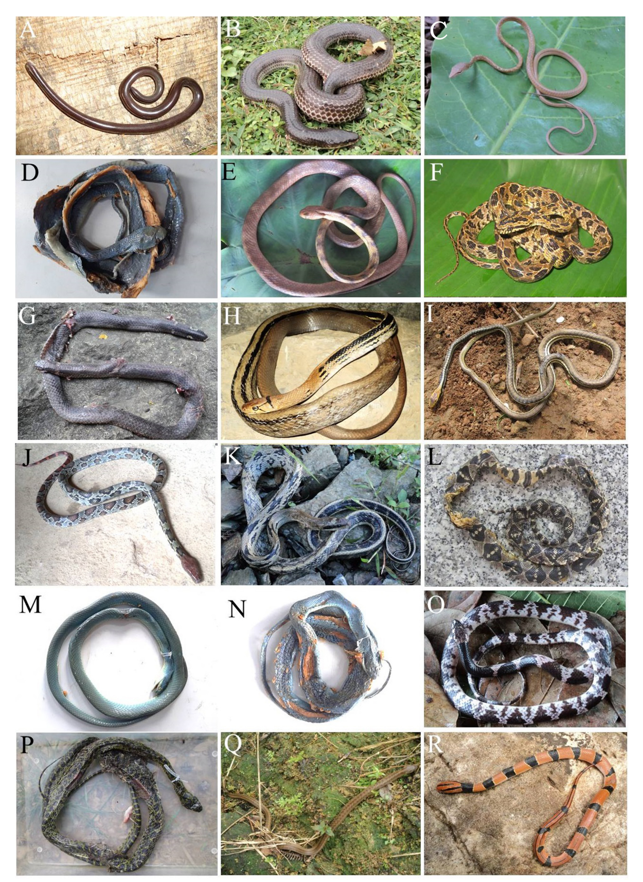
Fig. 6. Snake species recorded in Xuan Nha Nature Reserve, Vietnam: (A) Indotyphlops braminus, (B) Xenopeltis unicolor, (C) Ahaetulla prasina, (D) Boiga cyanea, (E) B. guangxiensis, (F) B. multomaculata, (G) Calamaria pavimentata, (H) Coelognathus radiatus, (I) Dendrelaphis pictus, (J) Elaphe moellendorffi, (K) Elaphe taeniura, (L) Euprepiophis mandarinus, (M) Gonyosoma coeruleum, (N) G. frenatum, (O) Lycodon futsingensis, (P) L. meridionalis, (Q) Oligodon fasciolatus, and (R) Oreocryptophis porphyraceus.