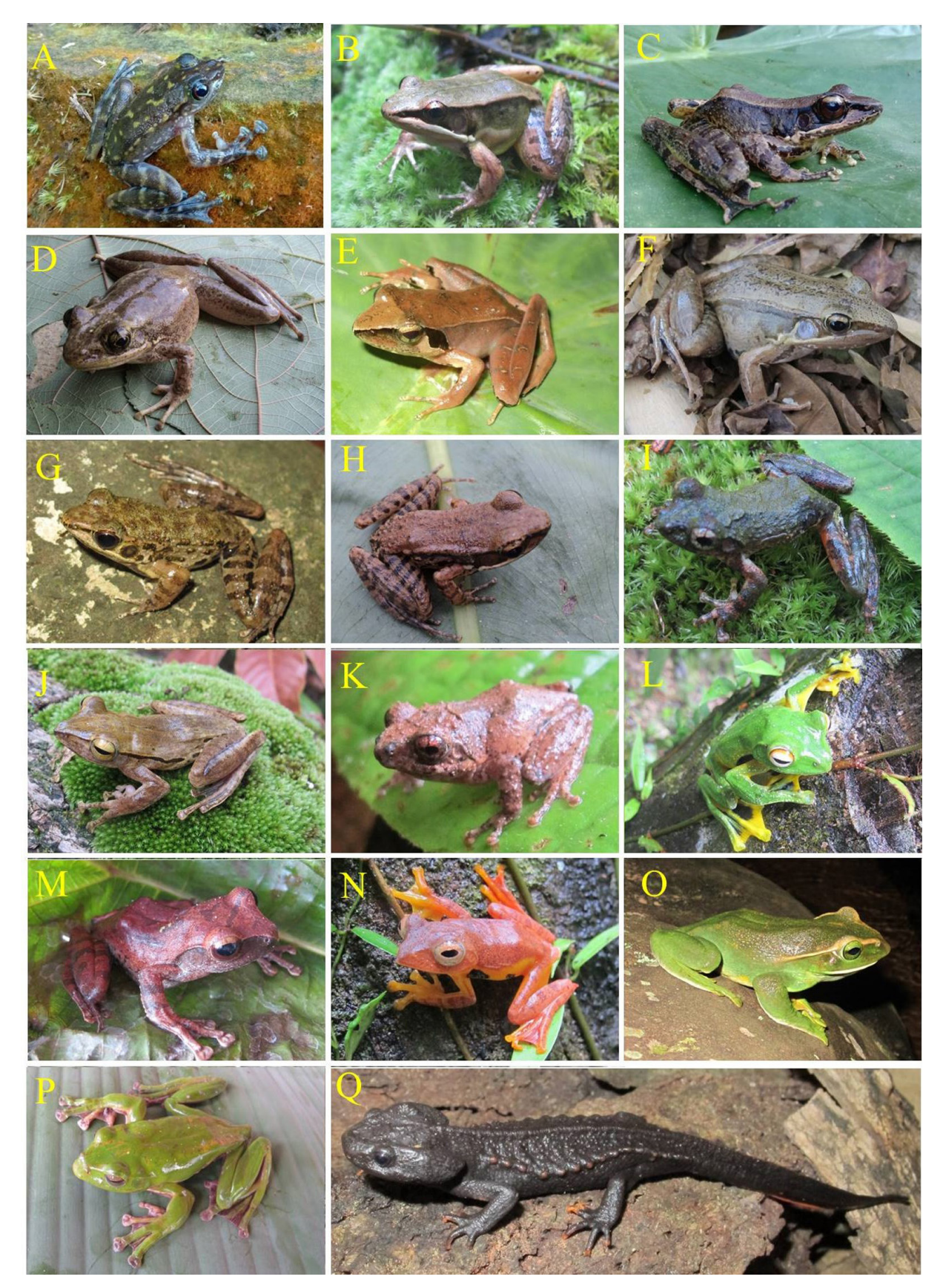
Fig. 4. Additional amphibian species recorded in Xuan Nha Nature Reserve, Vietnam: (A) Amolops cremnobatus, (B) Nidirana chapaensis, (C) Odorrana nasica, (D) O. tiannanensis, (E) Rana johnsi, (F) Sylvirana guentheri, (G) S. maosonensis, (H) S. nigrovittata, (I) Kurixalus bisacculus, (J) Polypedates megacephalus, (K) Raorchestes parvulus, (L) Rhacophorus kio, (M) R. orlovi, (N) Rhacophorus rhodopus, (O) Zhangixalus feae, (P) Z. pachyproctus, and (Q) Tylototriton pasmansi obsti.