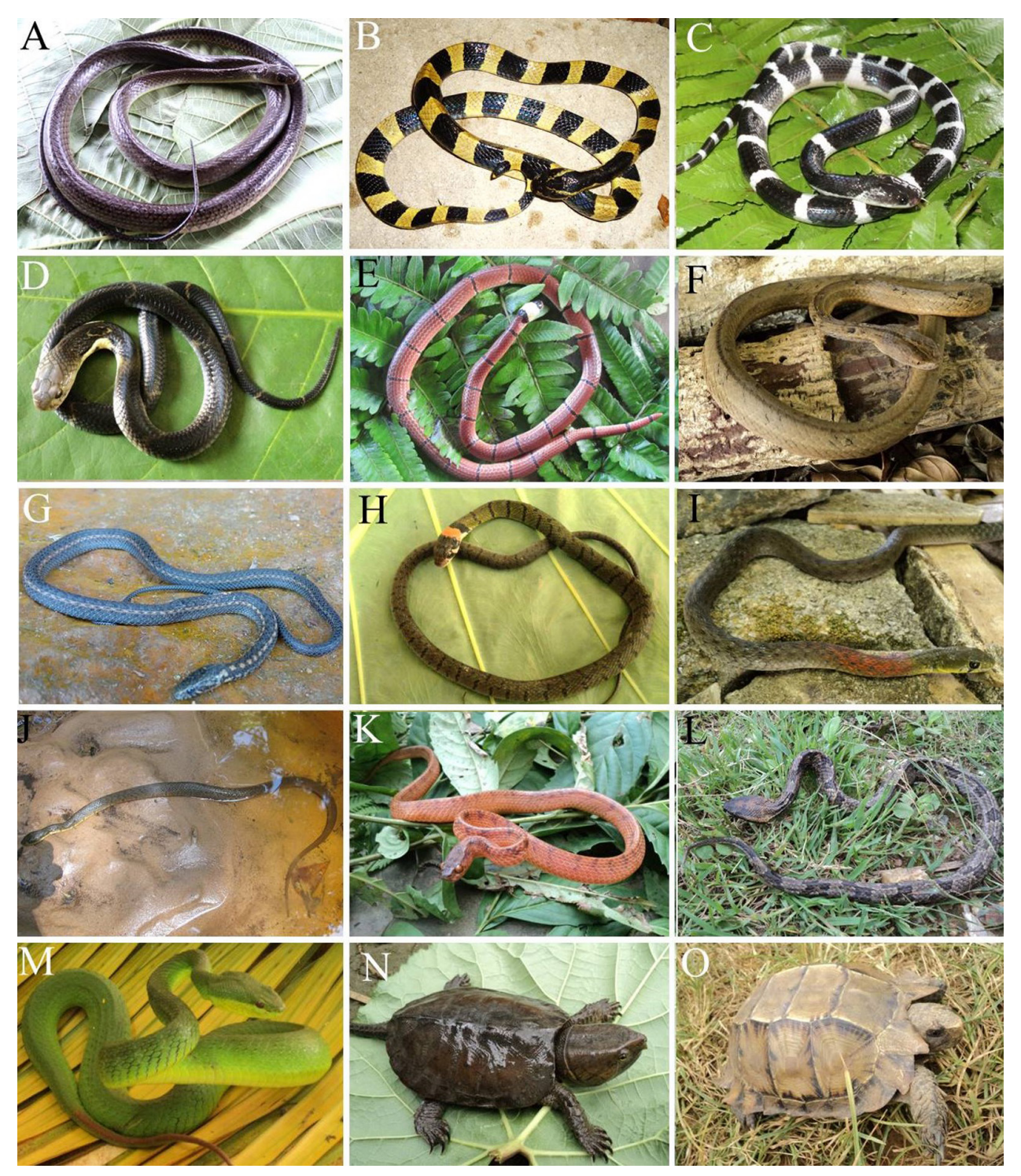
Fig. 7. Snake and turtle species recorded in Xuan Nha Nature Reserve, Vietnam: (A) Ptyas korros , (B) Bungarus fasciatus , (C) Bungarus wanghaotingi , (D) Naja atra , (E) Sinomicrurus macclellandi , (F) Psammodynastes pulverulentus , (G) Hebius chapaensis , (H) Rhabdophis nigrocinctus , (I) Rhabdophis helleri , (J) Trimerodytes percarinatus , (K) Pareas hamptoni , (L) Ovophis monticola , (M) Trimeresurus albolabris , (N) Platysternon megacephalum , and (O) Manouria impressa .

rows 19–19–15; ventrals 198; cloacal scale paired; subcaudals 100, paired. Coloration in preservative: dorsal surface green; belly greenish (determination after Liu et al. 2021).