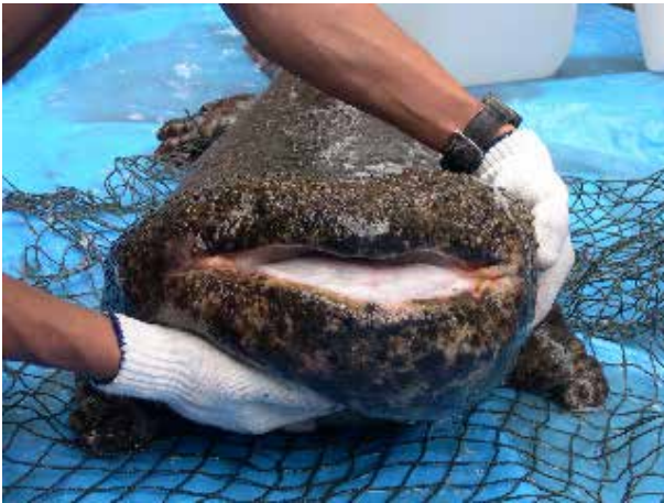
Figure 3. Andrias japonicus is the second largest Cryptobranchid and reaches 150 cm in total length and 44 kg in weight.

population densities and demography, habitat variables including channelization and watershed characteristics, assessing the effects of obstacle removal to migration, such as dams, and the provision of artificial habitats on survival and recruitment (Browne et al. 2012a, b).