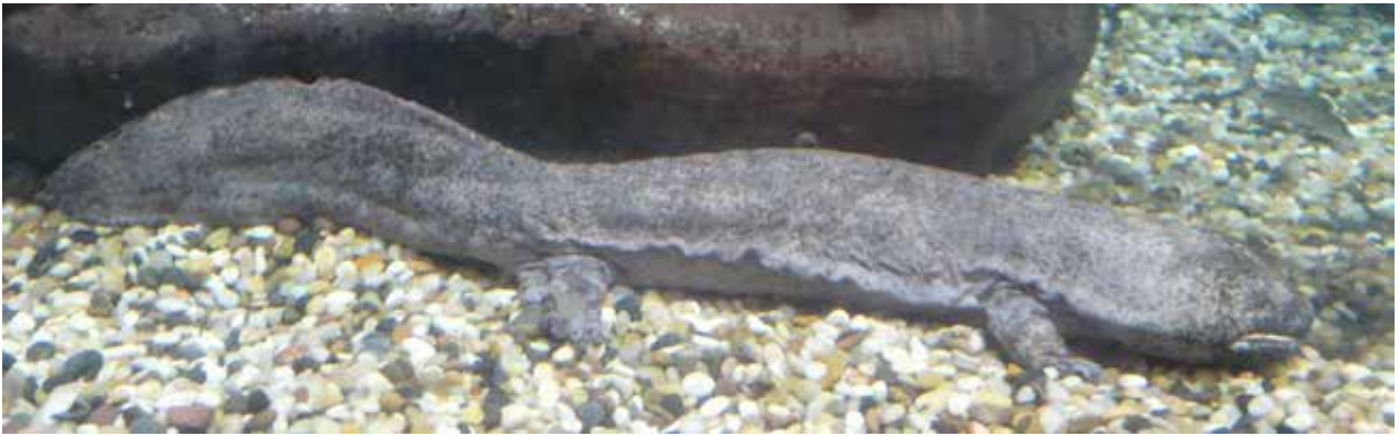
Figure 1. Andrias davidianus is the largest and most threatened Cryptobranchid, and can reach 200 cm in total length and 59 kg in weight.

tion and life stage survival, and environmental threats. The most appropriate survey techniques to achieve this knowledge will depend on survey objectives in concert with logistical constraints including the type of habitat surveyed (Dodd 2009). The choice of survey techniques must consider interacting factors, including the species' autecology, targeted life stages, and season, as well as water depth, velocity, and clarity (Dodd 2009). Survey techniques must minimize environmental disturbance and possible negative effects on the health of the targeted individuals and populations through the spread of pathogens and trauma to individuals.