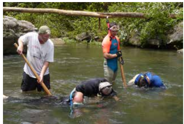
Figure 7. Snorkeling and turning small substrate is a good technique for surveying small to large C. alleganiensis in water of moderate depth.

Standard scuba diving equipment provides unlimited mobility in terms of the area a worker can survey. In contrast, divers using a stationary anchored boat, canoe, or bank-side hookah system are limited by air line length.