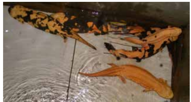
Figure 2. Genetic drift and selection for color traits in A. davidianus have resulted in orange, piebald, and albino strains.

The conservation of A. japonicus relies on the maintenance of the populations that generally still remain in suitable habitats (Tochimoto et al. 2008). Although A. japonicus was harvested in the past, strict protection is now in place to prevent this species from exploitation. However, threats include habitat modification and other anthropogenic changes, including pollutants, and the introduction of A. davidianus in some systems. Consequently, the conservation needs of A. japonicus include surveying