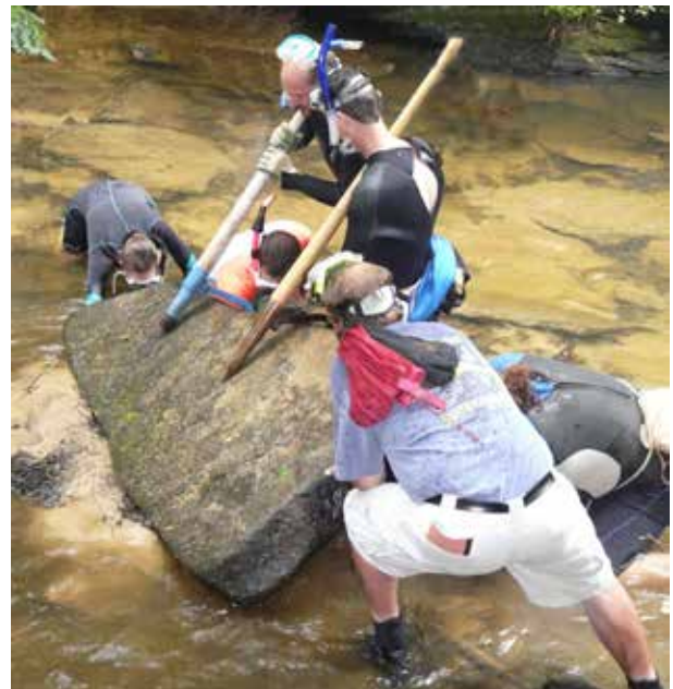
Figure 6. Turning heavy rocks, combined with snorkeling with face masks and nets is an effective means to survey juvenile and adult C. alleganiensis . Image Robert Browne.

Foster et al. (2008) turned rocks to survey for adult and larval C. alleganiensis and captured 157 in 317 person hours (0.5 individuals per person hour (pph)). Bank searching through turning substrate within four meters of the stream bank yielded 14 juveniles in 55 person hours (0.25 pph). Bank searches of four of the seven inhabited sites yielded no C. alleganiensis , but at three sites bank searching was more efficient than rock turning (Foster et al. 2008). Capture rates of C. alleganiensis in four streams in the White River drainage, Missouri, varied from zero to 2.5 pph (Trauth et al. 1992). Okada et al. (2008) used diurnal wading and substrate surveys with one to three people searching under piled rocks or leaves (by hand or with dip-nets) to observe 227 A. japonicus at a rate of 1.4 pph.