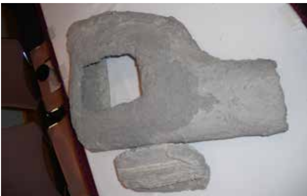
Figure 8. Artificial spawning dens for C. alleganiensis are used to increase the number of nesting sites and allow monitoring of egg production and larval survival.

Nocturnal spotlighting has the advantage of producing minimal substrate disturbance, as rocks are lifted after the protruding heads of C. alleganiensis are observed. Spotlighting also allows observation of migratory and other behaviors. A spotlight survey of C. alleganiensis in West Virginia, USA, showed that increased nocturnal activity is correlated with high water levels, and suggested that spotlight surveys for mature adults are best conducted in May and June in this region (Humphries and Pauley 2000). Kawamichi and Ueda (1998) used nocturnal surveys combined with wading for A. japonicus in streambeds, and this technique, without substrate turning, is the most common survey technique for A. japonicus .