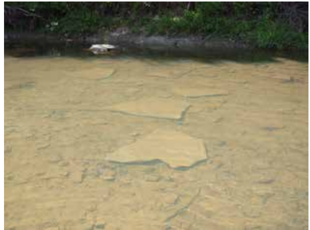
Figure 5. Natural rock placed in stream to provide habitat and sampling locations for C. alleganiensis .

of water bodies and geographic region are primary considerations when selecting the most promising season for surveying different life stages.