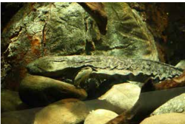
Figure 4. Cryptobranchus alleganiensis has been the subject of the most diverse and innovative survey methods of all Cryptobranchids.

Survey design needs to incorporate the recognition of potential biases through the choice of technique, surveyed microhabitat, species, and life stage (Dodd 2009). Nowakowski and Maerz (2009) tested the efficacy of surveys of larval stream salamanders by comparing the mark-recapture success of passive leaf litter trapping and dip netting. Significant size bias occurred, with traps capturing a higher proportion of large individuals and dip netting yielding a greater proportion of smaller size classes. The survey efficiency of first and second order streams was greater at low salamander densities with time-constrained opportunistic sampling, but greater with quadrat sampling when salamanders were at high densities (Barr and Babbitt 2001). Nowakowski and Maerz (2009) concluded that the physical dynamics