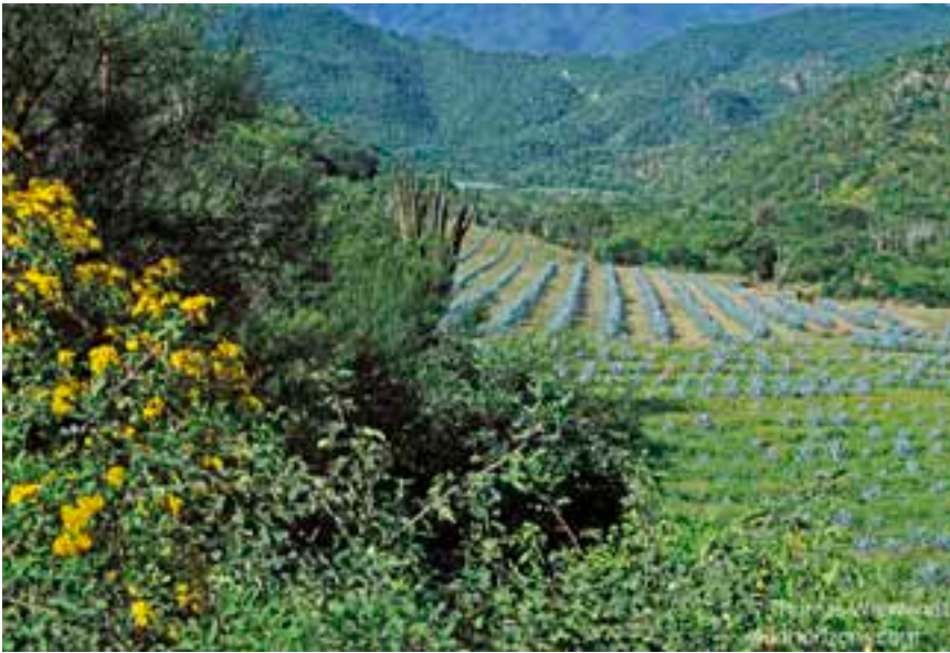
Fig. 10. Agave cultivation in Mexico results in the destruction of seasonally dry tropical forests.