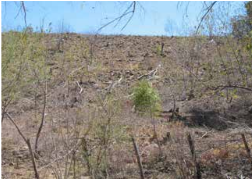
Fig. 8. Destruction of seasonally dry tropical forest near Álamos, Sonora, Mexico.

3. Conservation management plans for each of the species of beaded lizards should be developed from an integrative perspective based on modern population assessments, genetic information, and ecological (e.g., soil, precipitation, temperature) and behavioral data (e.g., social structure, mating systems, home range size).