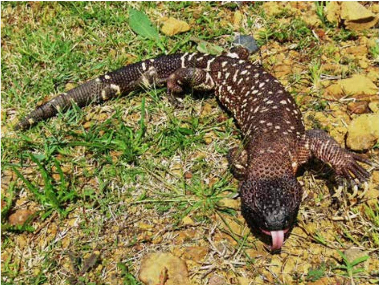
Fig. 2. Adult Mexican beaded lizard ( H. h. horridum ) observed on 11 July 2011 at Emiliano Zapata, municipality of La Huerta, coastal Jalisco, Mexico.