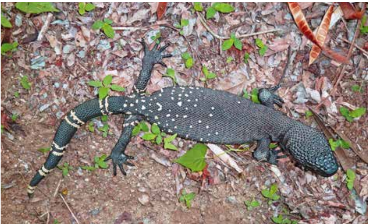
Fig. 4. Adult Guatemalan beaded lizard ( Heloderma horridum charlesbogerti ) from the Motagua Valley, Guatemala.