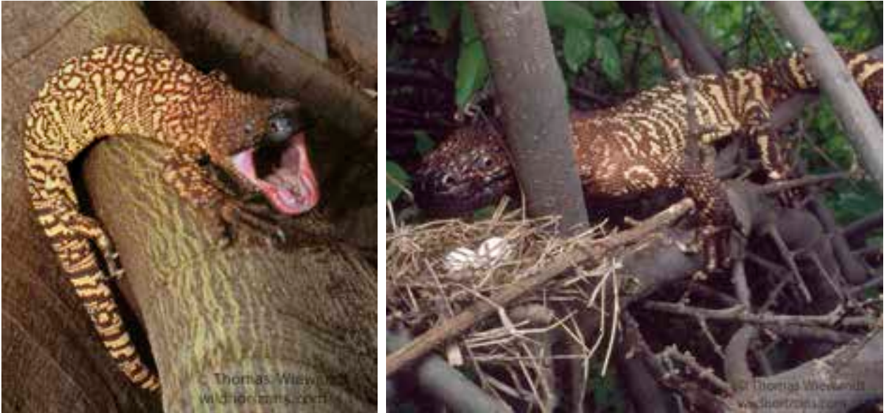
Fig. 1. A. Adult Río Fuerte beaded lizard ( Heloderma horridum exasperatum ) in a defensive display (Alamos, Sonora). B. Adult Río Fuerte beaded lizard raiding a bird nest (Alamos, Sonora).