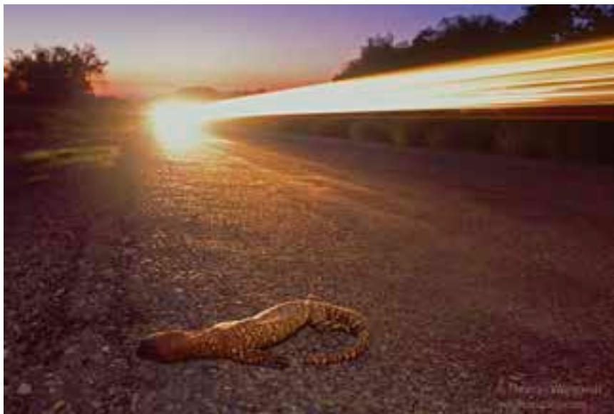
Fig. 9. A dead-on-the-road (DOR) H. exasperatum (sensu stricto) near Álamos, Sonora, Mexico. Vehicles on paved roads are an increasing threat to beaded lizards, Gila monsters, and other wildlife.

Such a conservation plan is in place for the Guatemalan beaded lizard ( H. charlesbogerti ) by CONAP-Zootropic ( www.ircf.org/downloads/PCHELODERMA-2Web.pdf ). Also, aspects of burgeoning human population growth must be considered, since outside of PNAs these large slow-moving lizards generally are slaughtered on sight, killed on roads by vehicles (Fig. 9), and threatened by persistent habitat destruction primarily for agriculture and cattle ranching (Fig. 10). For discussions on conservation measures in helodermatid lizards, see Sullivan et al. (2004), Beck (2005), Kwiatkowski et al. (2008), Douglas et al. (2010), Domínguez-Vega et al. (2012), and Ariano-Sánchez and Salazar (2013).