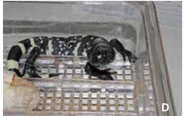
Fig. 5. A. Juvenile Heloderma horridum exasperatum (in situ, Álamos, Sonora, Mexico). B. Neonate Heloderma h. horridum (wild-collected July 2011, Chamela, Jalisco). C. Neonate Heloderma horridum alvarezii (Río Lagartero Depression, extreme western Guatemala). D. Neonate Heloderma horridum charlesbogerti (hatched at Zoo Atlanta in late 2012).

Owing to this unusual location, we suggest a re-examination of this museum specimen to verify its identity. Neonates and juveniles of H. h. exasperatum resemble adults in color pattern (Fig. 5a), but they show greater contrast (i.e., a pale yellow to nearly white pattern on a ground color of brownish-black). Also, their color pattern can be distinguished from that of adults (e.g., no yellow speckling between the tail bands), and an ontogenetic increase in yellow pigment occurs (Bogert and Martín del Campo 1956; Beck 2005).