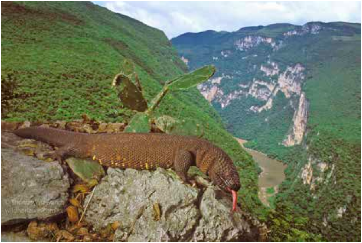
Fig. 3. Adult Chiapan beaded lizard ( Heloderma horridum alvarezii ) from Sumidero Canyon in the Río Grijalva Valley, east of Tuxtla Gutiérrez, Chiapas, Mexico.