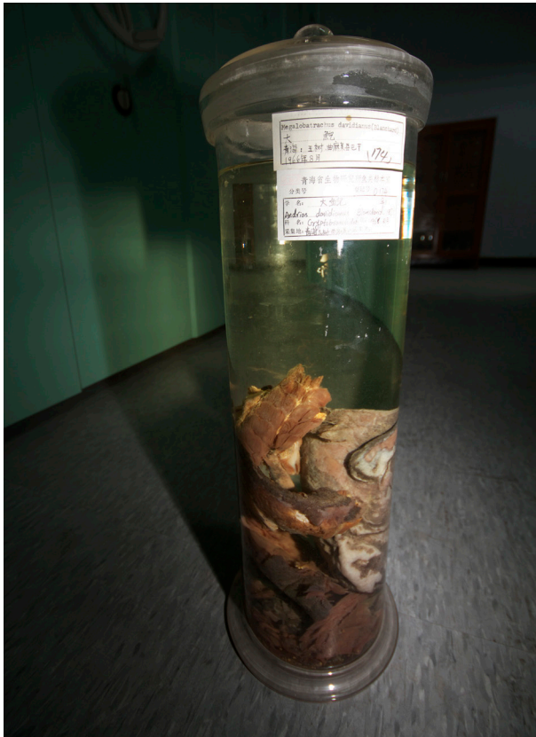
Fig. 1. The adult female Andrias captured in Qinghai, China in 1966. This specimen now resides at the Northwest Plateau Institute of Biology in Xining.

During our discussions with local people and government officials, we heard several anecdotal reports of Andrias being caught in recent years. Local Bureau of Forestry officials and one layman in Qumalai told of an adult Andrias that had been caught and thrown back by a fisherman at the same locality as the original record (Trap Locality 9, Figure 2) around 1992. The same officials in Qumalai and several officials in Zhiduo told of an Andrias that had been caught in the Nieqia River at its confluence with the Tongtian River in Qumalai (34.016, 95.817) between 1996–1997. This individual was reportedly sent to Xian and sold for food. An official from Zhiduo also reported that this fisherman's brother had caught an Andrias in a slow part of the Tongtian River between Zhiduo and Yushu earlier in 2012. Finally, two residents of Yushu reported seeing dead Andrias in the Tongtian River after the earthquake of 2010. Only one other species of caudate ( Batrachuperus tibetanus ) is