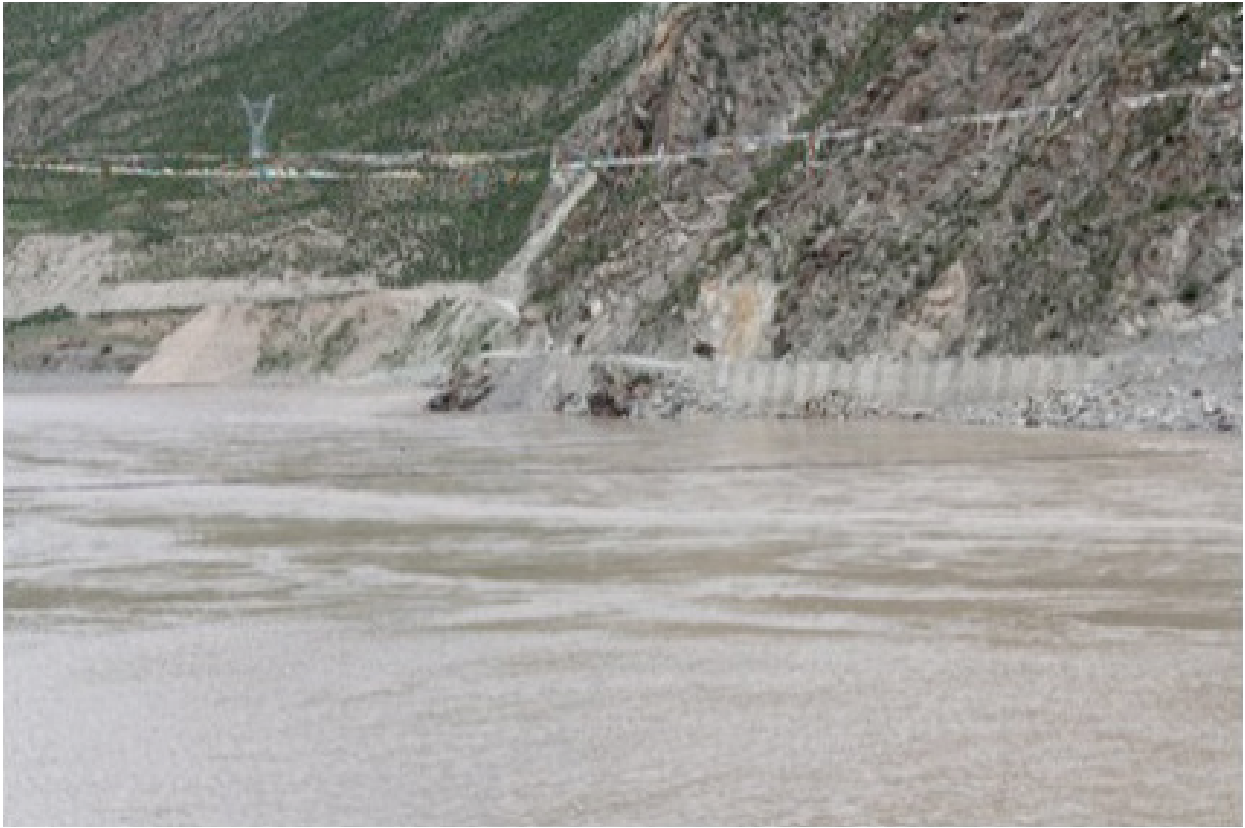
Fig. 5. Stream bank degradation caused by road construction along the Tongtian River.

covery should continue to be a top priority for Andrias conservation.