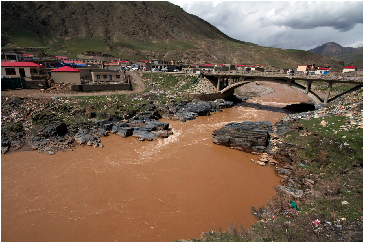
Fig. 3. The locality where the first and only Andrias was collected from Bagan, Qinghai in 1966. Today, the water is turbid and appears largely unsuitable for Andrias .