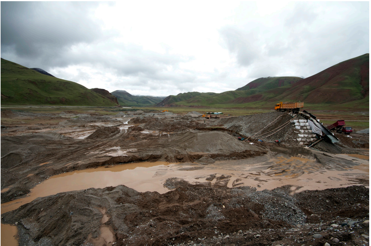
Fig. 4. A mining operation on the banks of the Tongtian River, near Qumalai, Qinghai.