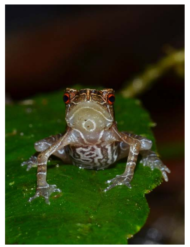
Fig. 4. Ventral pattern of froglets of Andinophryne olallai . Manduriacu, Imbabura Province, Ecuador.

ence is that dorsal and flank coloration is not uniform in all individuals; the head and dorsum were darker brown than the light brown-tan flanks in most live animals observed at Manduriacu.