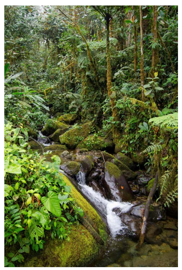
Fig. 2. Andinophryne olallai habitat from Río Manduriacu, Imbabura Province, Ecuador. All individuals encountered were found perched on branches or leaves along streams similar to the stream pictured here.

All information on A. olallai reported by Hoogmoed (1985) was based on two adult specimens. Our observations of froglets and juveniles mark the first reported information on the species' pre-adult morphology and ontogeny. Ontogenetic change in color pattern is considerable (Fig. 3), and is one of the few reported cases of such an extreme change in bufonids in Ecuador (see Hoffman and Blouin 2000). We observed a total of two froglets (mean SVL 13.1 mm) and five juveniles (mean SVL 26.6 mm). Froglets have a copper, gold, and white dorsum with a mottling pattern reminiscent of some species of Atelopus (Fig. 3: A, B). This contrasts with the patternless brown dorsum of the adults. The venter of froglets have a series of white undulating lines that extend the length of the body (Fig. 4). The iris in froglets and juveniles is more vibrantly red than in adults, which have a yellow copper-colored iris that is darker medially near the horizontally oval pupil. Froglets also differ from adults in lacking tubercles and parotoid