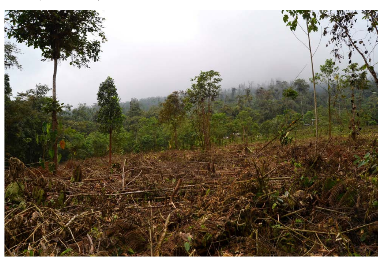
Fig. 5. A recently deforested plot of land that is less than one km from the population of Andinophryne olallai in Manduriacu, Imbabura Province, Ecuador.

Andinophryne olallai is currently classified as Data Deficient by the IUCN Red List (Coloma et al. 2010). However, more recent assessments considers A. olallai as Endangered based on its restricted range, the apparent extirpation of the species from the type locality and