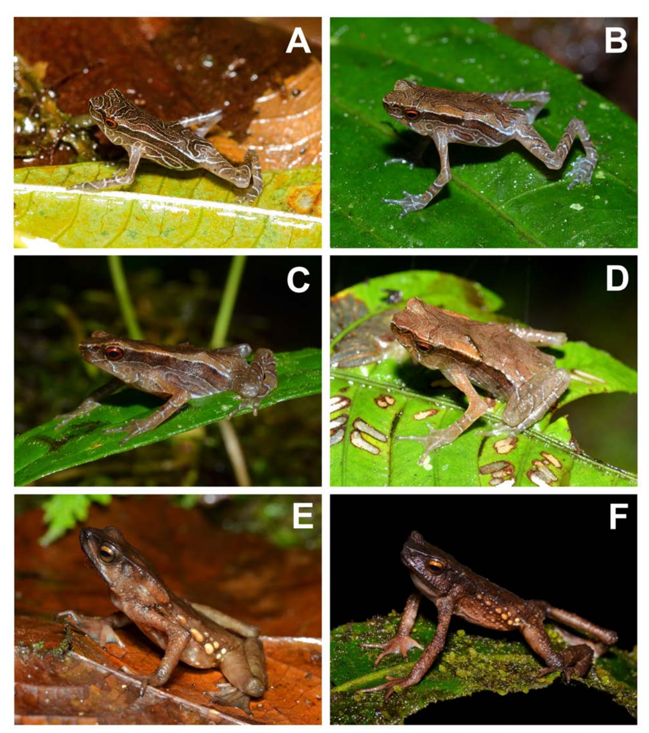
Fig. 3. Ontogenetic transformation of color and pattern in Andinophryne olallai from Río Manduriacu, Imbabura Province, Ecuador. (A) Froglet (11 mm SVL; in situ), (B) Froglet (15.1 mm SVL; in situ), (C) Juvenile (26.3 mm SVL; in situ), (D) Juvenile (28.1 mm SVL; in situ), (E) Adult (44.6 mm SVL; ex situ), (F) Adult (53.3 mm SVL; in situ). Note the progressive ontogenetic change in dorsal patterning from heavily mottled to no pattern; lack of parotoid glands and tubercles along the flank to presence of conspicuous parotoid glands and tubercles along the flank; a darkening of color from copper, tan, and white to dark brown; and iris color change from vibrant crimson to copper-orange.