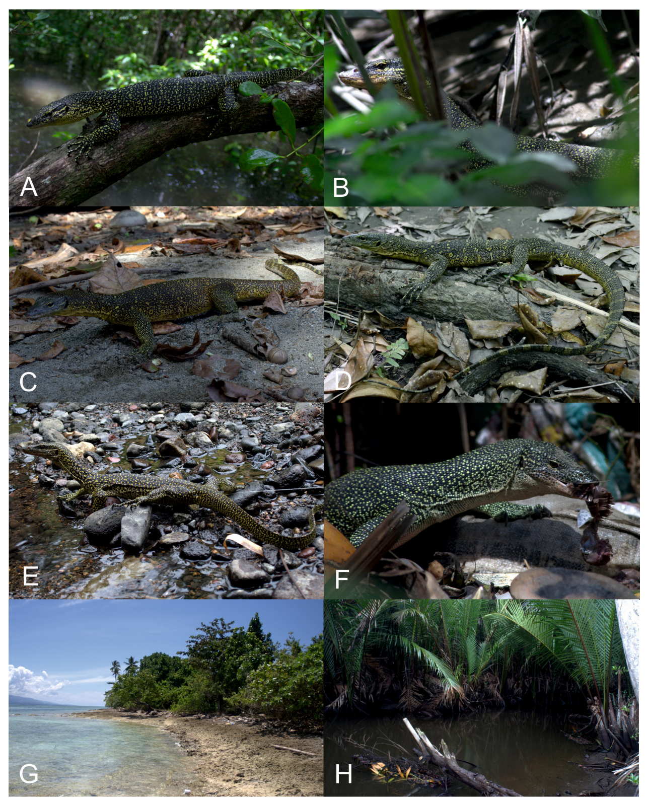
Fig. 1. Mangrove monitors and their habitats: V. cerambonensis on Ambon (A), Seram (B), and Buru (C, D). Varanus rainerguen theri on Halmahera (E) and Obi (F). Coastal vegetation on Ambon (G) and Nipa swamp (H).