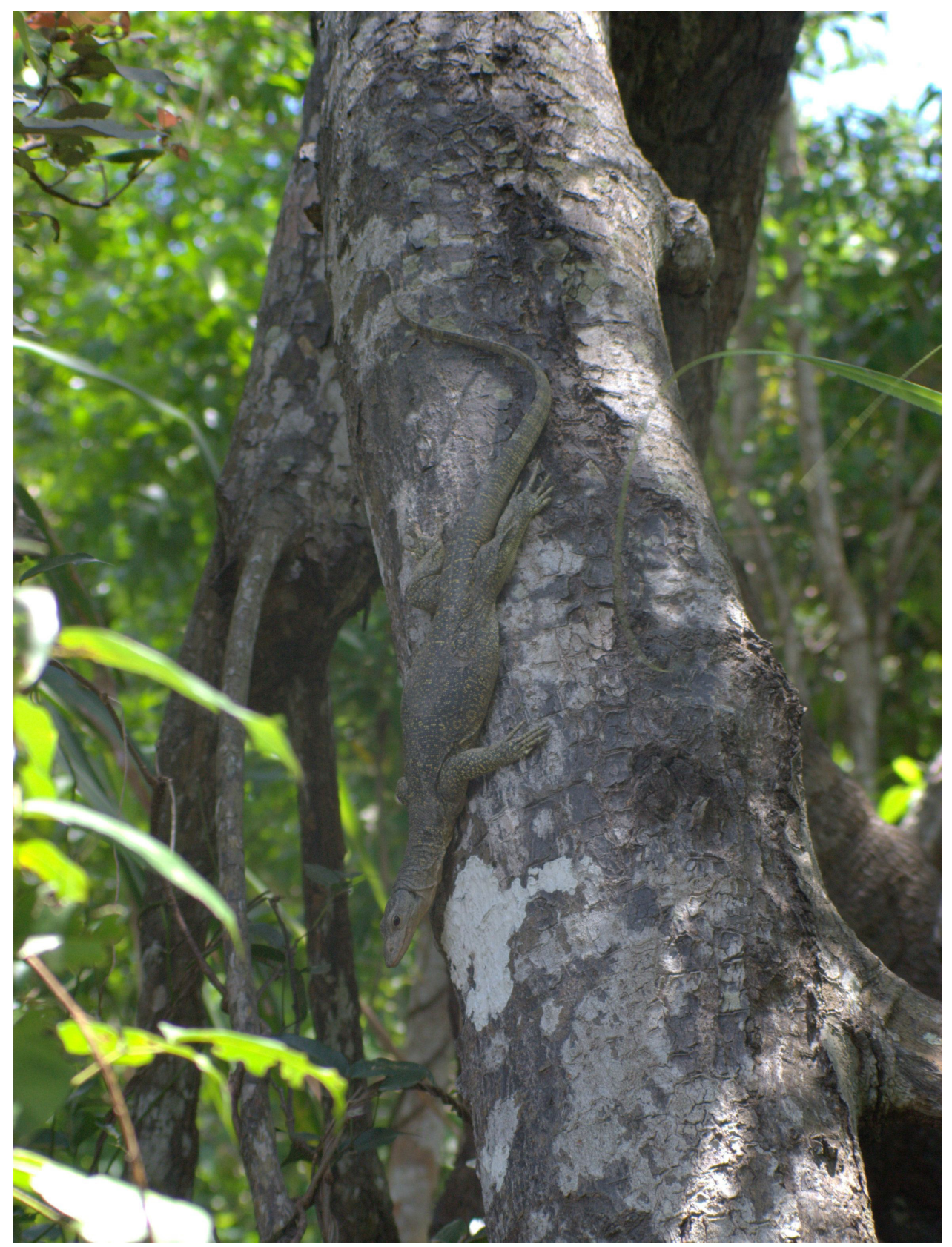
Varanus cerambonensis on the island of Buru.