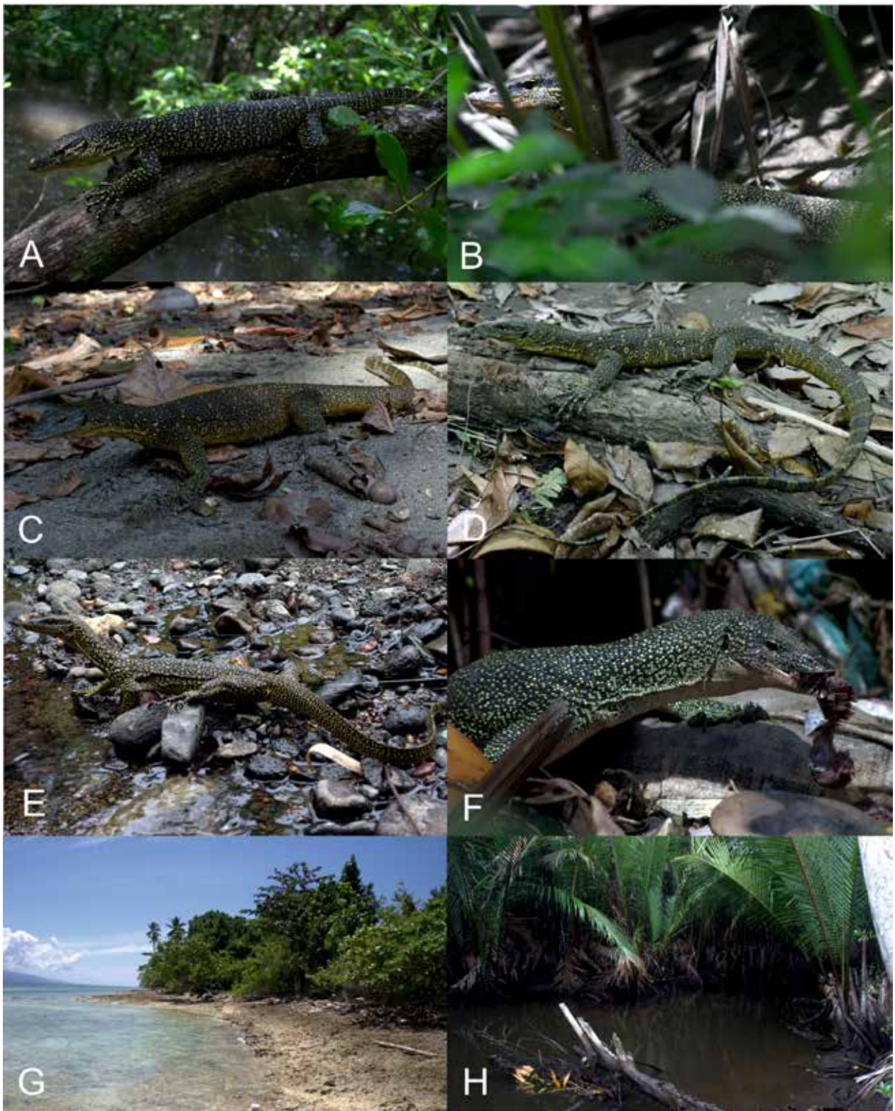
Fig. 1. Mangrove monitors and their habitats: V. cerambonensis on Ambon (A), Seram (B), and Buru (C, D). Varanus rainerguetheri on Halmahera (E) and Obi (F). Coastal vegetation on Ambon (G) and Nipa swamp (H).