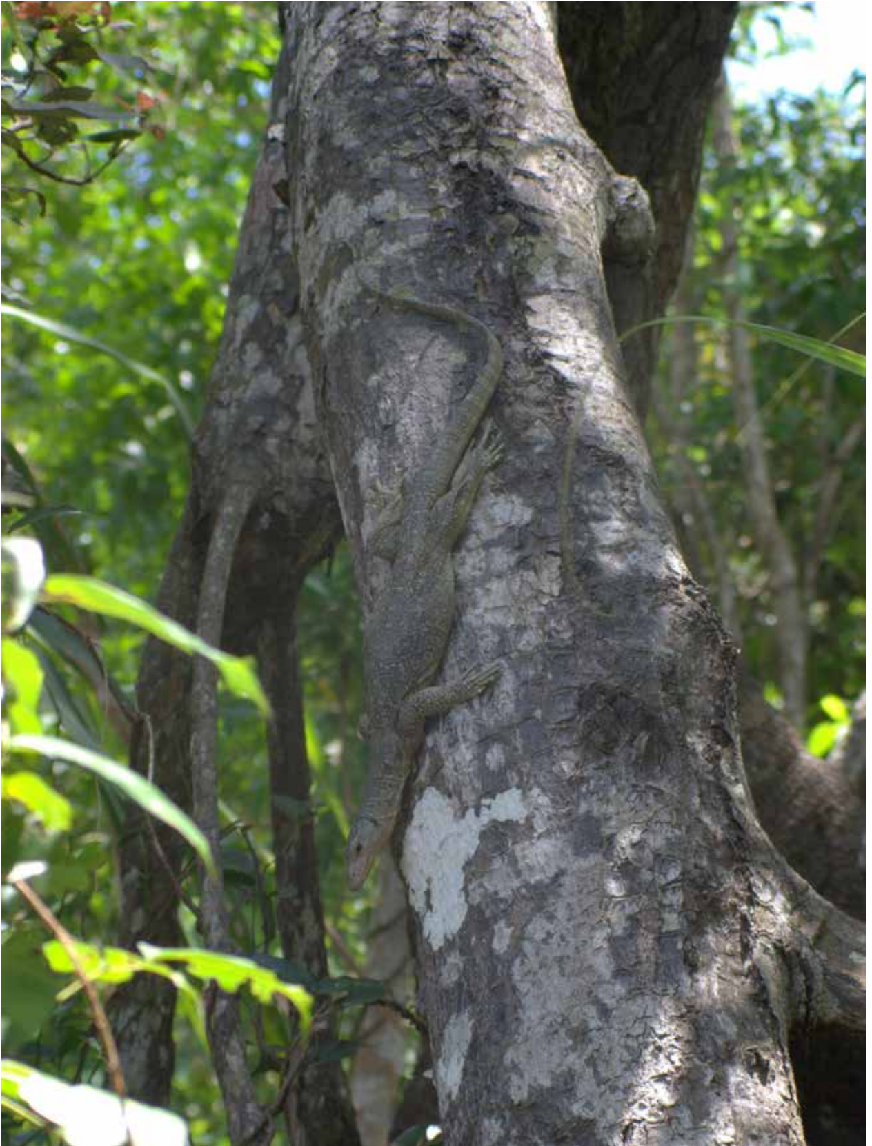
Varanus cerambonensis on the island of Buru.