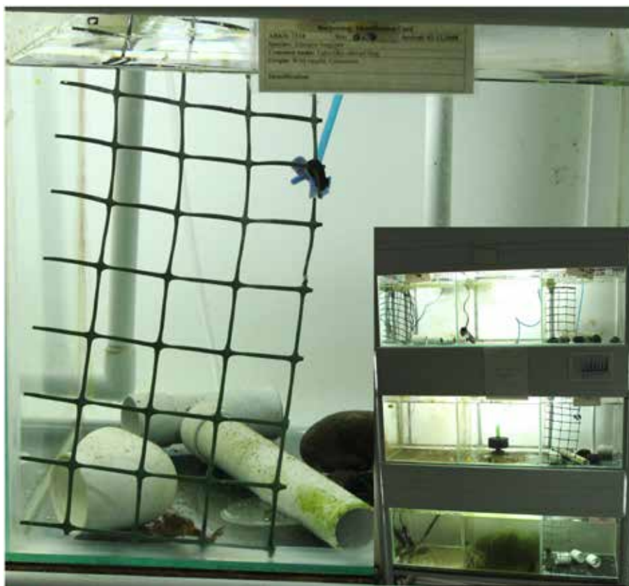
Fig. 3. Aquarium for X. longipes , set within a custom built, centrally filtered system (inset photograph) at ZSL London Zoo. Life support system and sump not shown – see text for details.

waste (measured using Photometer 7100 [Palintest]) was difficult to manage and tadpoles were briefly exposed to high levels of ammonia (>1 mg/L) and, later, nitrite (up to 2.4 mg/L) without mortality. A regime of 10% water changes in the morning and 50% water changes in the afternoon, both accompanied by removal of uneaten food on the bottom of tanks by siphon and thorough cleaning of sponge filters in aquarium water, helped to suppress nitrogenous waste to more acceptable, but still detectable levels (Ammonia: <0.1 mg/L; Nitrite: <0.5 mg/L) for most of the tadpole rearing period.