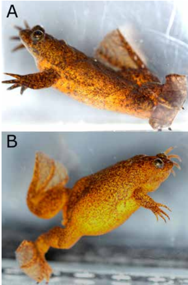
Fig. 1. Male (top) and female (bottom) adults of Xenopus longipes in the collection at ZSL London Zoo (ZIMS ID 7441).

Captive colonies of the Critically Endangered X. longipes were established in 2008 at Antwerp Zoo (later moved to Cologne Zoo and one private breeder), Zoological Society of London (ZSL), London Zoo, and more recently in 2013, at the Steinhart Aquarium in the USA, for conservation research purposes (Browne et al. 2009; T. Ziegler pers. comm.; P. Janzen pers. comm.; D. Blackburn pers. comm.). The zoo colonies were intended to be assurance populations for conservation breeding. However, due to concerns over biosecurity and suitability of animals for release to the wild, the ZSL population was assimilated into the main collection with the focus now on conservation research aiming to document the reproductive biology of the species, as little is currently known. Such information is of importance for developing in situ conservation management strategies. Despite repeated attempts in all these institutions, however, efforts to breed and rear this species in captivity have failed, even with the use of artificial reproductive techniques (P. Janzen, pers. comm.; D. Blackburn pers. comm.).