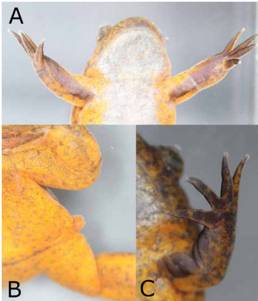
Fig. 2. Keratinized nuptial pads on the inside surfaces of the front limbs of male (A and C) and cloaca of a female X. longipes (B); note the cloacal papillae, which are absent in male frogs.

tair PRF; Fileder) and appears to be adequate for larval rearing.