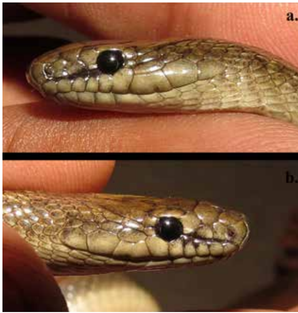
Fig. 2. Lateral aspect of Coronella brachyura (NCS 2); a, left side showing 8 supralabials and 5 th supralabial partly divided; b, right side showing 9 supralabials, 4–6 th touching eye.

labials, the 4 th and 5 th , sometimes 5 th and 6 th and rarely 4 th to 6 th (4 th and 5 th fide . Smith 1943) touch the eye (Fig. 2); 9–11 infralabials.