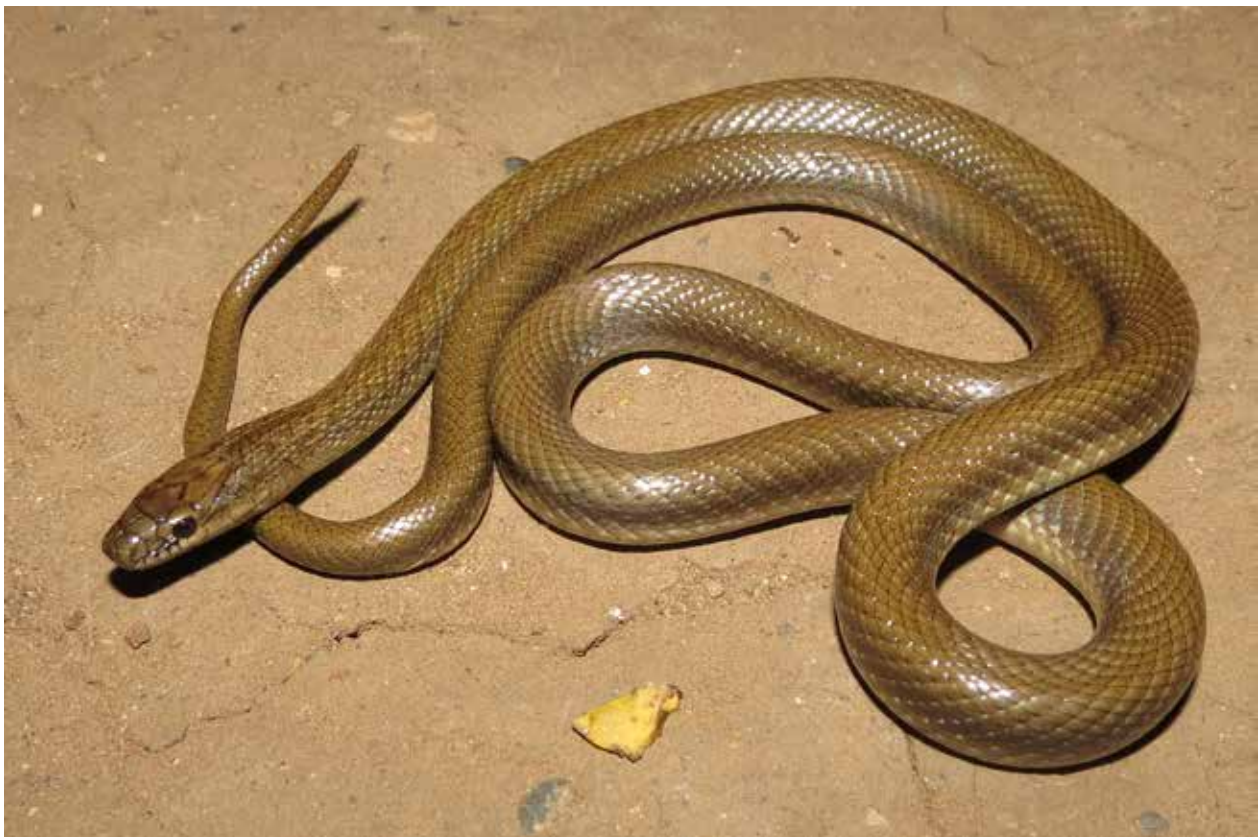
Fig. 1. Dorsal aspect of Coronella brachyura in life, from Surat, Gujarat, India.

Lepidosis: Dorsal scale rows (DSR) smooth, in most specimens 23:23:19 (23:23:21 in BNHS 3407; 23:23:17 in NCS 2); with single apical pit on the posterior margin. Ventrals 209–237 (maximum 224 vide Smith 1943); anal undivided; subcaudals 43–54 (46–53 vide Smith 1943); rostral wider than high, scarcely visible from above; 2 internasals, wider than long; 2 prefrontals, as long as wide, longer than the internasals; frontal bell shaped, slightly longer than wide; parietals longer than wide, slightly longer than frontal; 1 loreal, as long as high, rarely longer than high; 1 preocular reaching top of head; 2 postoculars; 2 anterior temporal scales; 2, rarely 1 posterior temporal scale(s); 8, sometimes 9 (8 vide Smith 1943) supra-