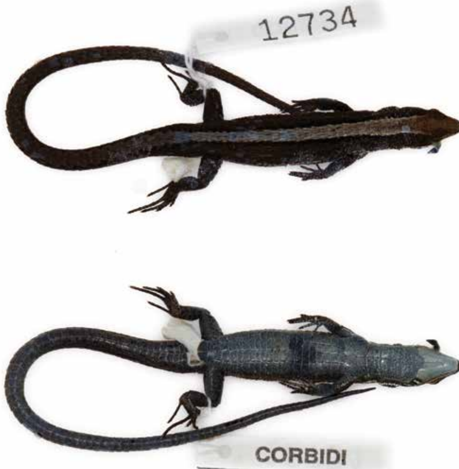
Fig. 1. Holotype of Pholidobolus ulisesi sp. nov. (CORBIDI 12734; male, SVL = 45.5 mm) in dorsal ( top ) and ventral ( bottom ) views.

= 29.75) than P. affinis (45–55), P. montium (35–50), P. prefrontalis (37–46), and P. macbrydei (31–43).