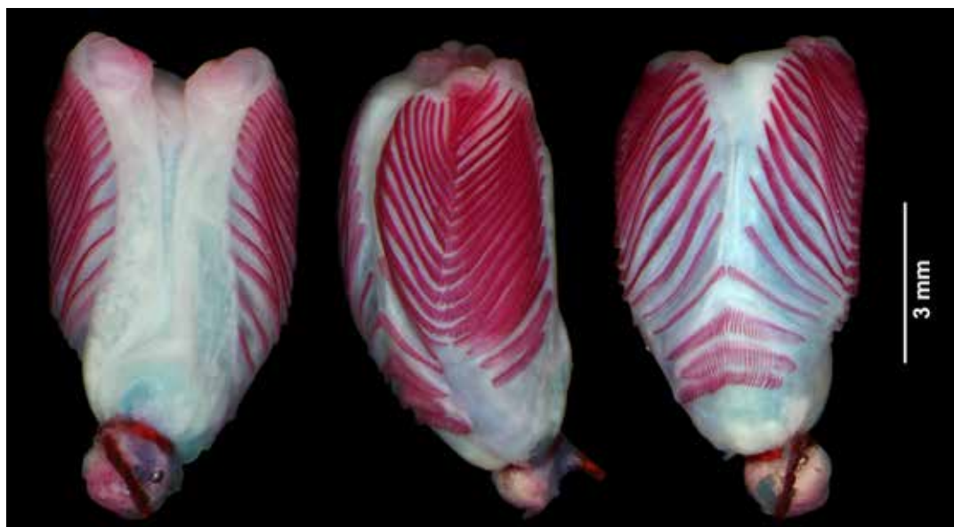
Fig. 5. Left hemipenis of Pholidobolus ulisesi sp. nov. (CORBIDI 12734 - holotype) in sulcate ( left ), lateral ( middle ), and asulcate ( right ) views.

Remarks: In a molecular phylogeny of Cercosaura and related taxa, Torres-Carvajal et al. (2015) showed, with high support, that Pholidobolus ulisesi ( Pholidobolus sp. in their paper) and P. hillisi are sister species. Together they form a clade sister to all other species of Pholidobolus . In addition, these authors found that both “ Cercosaura ” vertebralis and “ Cercosaura ” dicra were nested within Pholidobolus , and were therefore referred to this genus (Torres-Carvajal et al. 2015). An identical topology can be observed in a recent molecular phylogeny of the clade Cercosaurinae by Torres-Carvajal et al. (2016). Therefore, we adopt this taxonomic change in the discussion below.