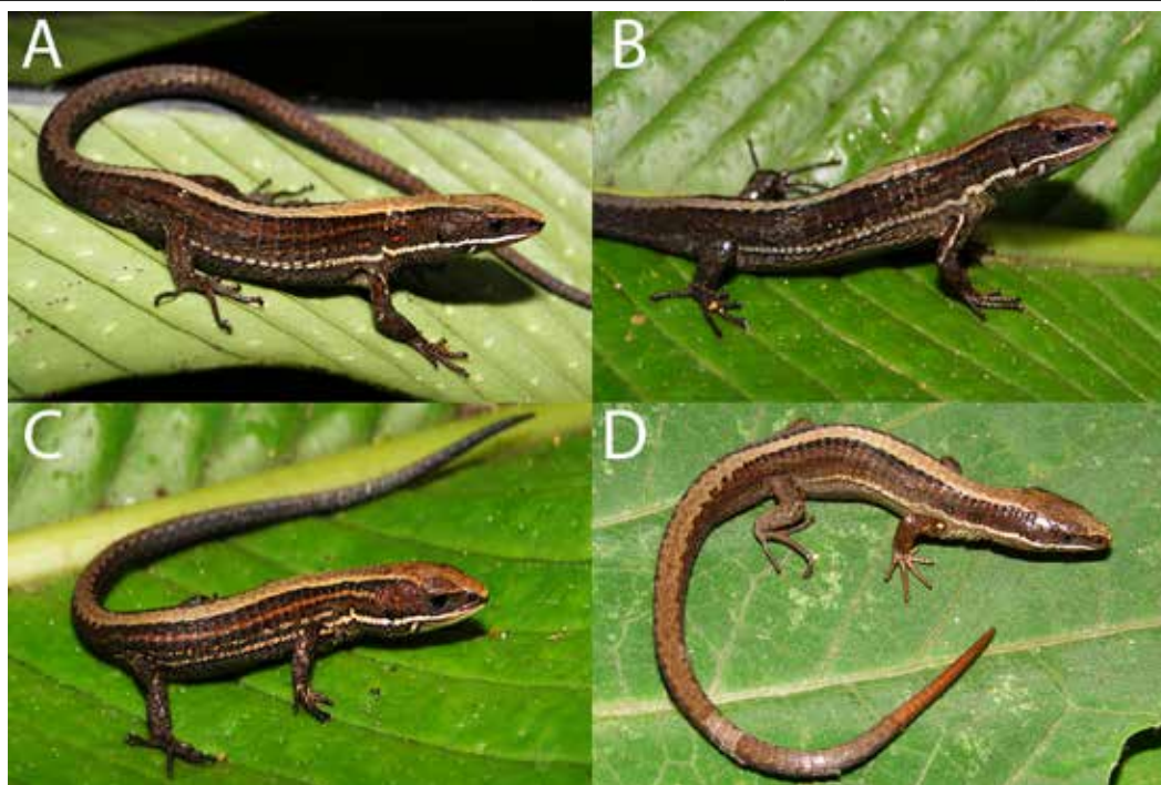
Fig. 3. Four individuals of Pholidobolus ulisesi sp. nov. in life. (A) holotype (CORBIDI 12734); (B) adult female (CORBIDI 12737); (C) juvenile (CORBIDI 12744); (D) adult male from Cañaris (photo voucher).

Variation: Variation in measurements and scutellation of Pholidobolus ulisesi is presented in Table 1. Usually two supraoculars, 2/3 (left/right) in specimen CORBIDI 12742; superciliaries usually four, 3/4 in CORBIDI 12749, 6/5 in CORBIDI 00873, and 5/5 in CORBIDI 00872; little intrusive scales present on each side, in the posterior angle of frontonasal in three specimens (CORBIDI 12735, 12741, 12744); usually seven supralabials, 7/6 in CORBIDI 00871, 12738 and 6/6 in CORBIDI 12742–43; infralabials usually six, 5/5 in CORBIDI 12738, 12740, 12742, 6/5 in CORBIDI 00873, 12744