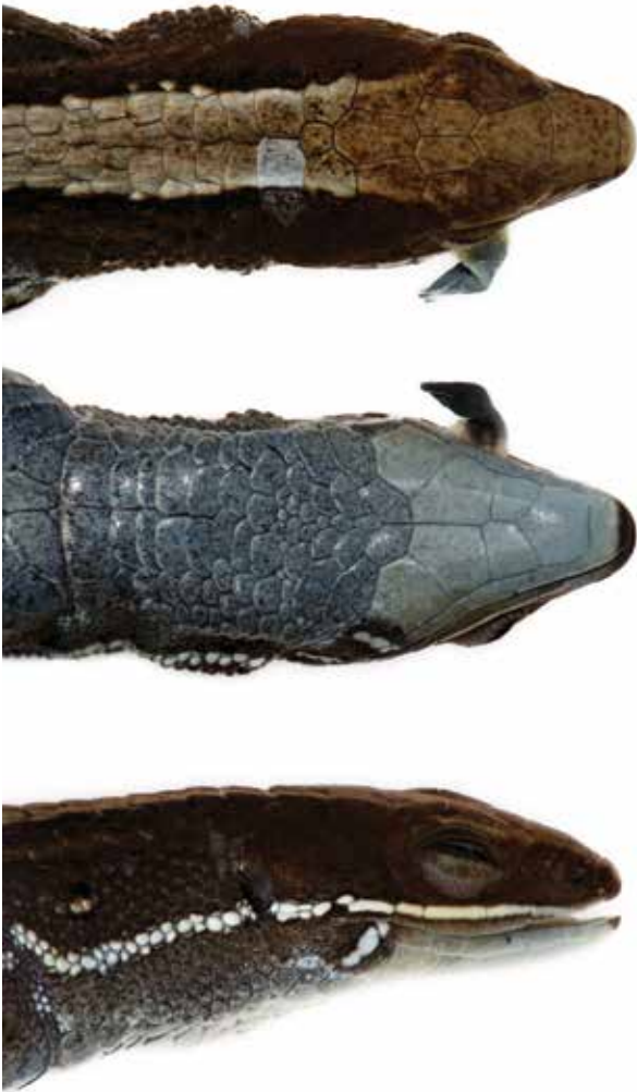
Fig. 2. Head of the holotype of Pholidobolus ulisesi sp. nov. (CORBIDI 12734) in dorsal (A), ventral (B), and lateral (C) views.

of nasal, directed lateroposteriorly, piercing nasal suture; loreal rectangular; frenocular enlarged, in contact with nasal, separating loreal from supralabials; supraoculars two, with the first being the largest; four elongate superciliaries, first one enlarged, in contact with loreal; palpebral disk divided into two pigmented scales; suboculars three, elongated and similar in size; three postoculars, ventral one smaller than the others; ear opening vertically oval, without denticulate margins; tympanum recessed into a shallow auditory meatus; mental semicircular, wider than long; postmental pentagonal, slightly wider than long, followed posteriorly by three pairs of genials, the anterior two in contact medially and the posterior one separated by postgenials; all genials in contact with infralabials; gulars imbricate, smooth, widened in two longitudinal rows; gular fold incomplete; posterior row of gulars (collar) with two enlarged scales medially, larger than the anterior gulars.