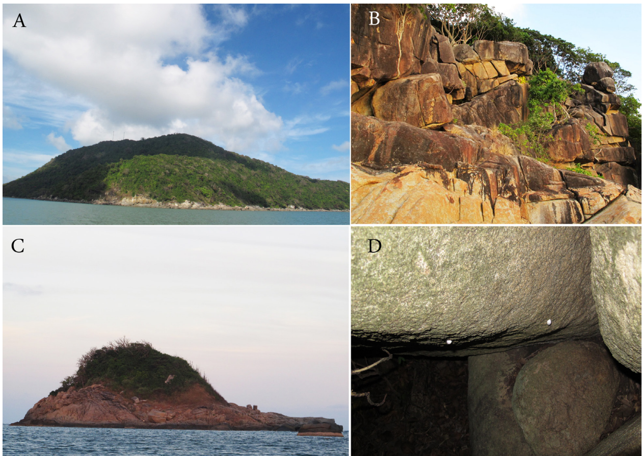
Fig. 1. Habitat of Cnemaspis psychedelica . A. Hon Khoai Island; B. Microhabitat on Hon Khoai; C. Hon Tuong Island; D. Deposited eggs on Hon Tuong Island.

Basic knowledge on the current population status of C. psychedelica , its ecology and potential threats are still lacking, as it is the case for most lizard species in the region. To better understand the threat level of a species, population size estimations provide essential baseline information and are thus crucial for wildlife management strategies and the assessment of the conservation status of populations and species (Ngo et al. 2016; Reed et al. 2003; Traill et al. 2007). The present study aims to provide the first assessment of the population size of C. psychedelica as well as an evaluation of potential threats, in particular human impacts, in order to assess its conservation status and develop adequate conservation strategies. We further investigated seasonal variation in population size and structure by conducting field surveys both during the wet and dry seasons. In addition, we surveyed another, smaller offshore island in proximity to Hon Khoai to investigate potential occurrence of the species to assess its distribution range.