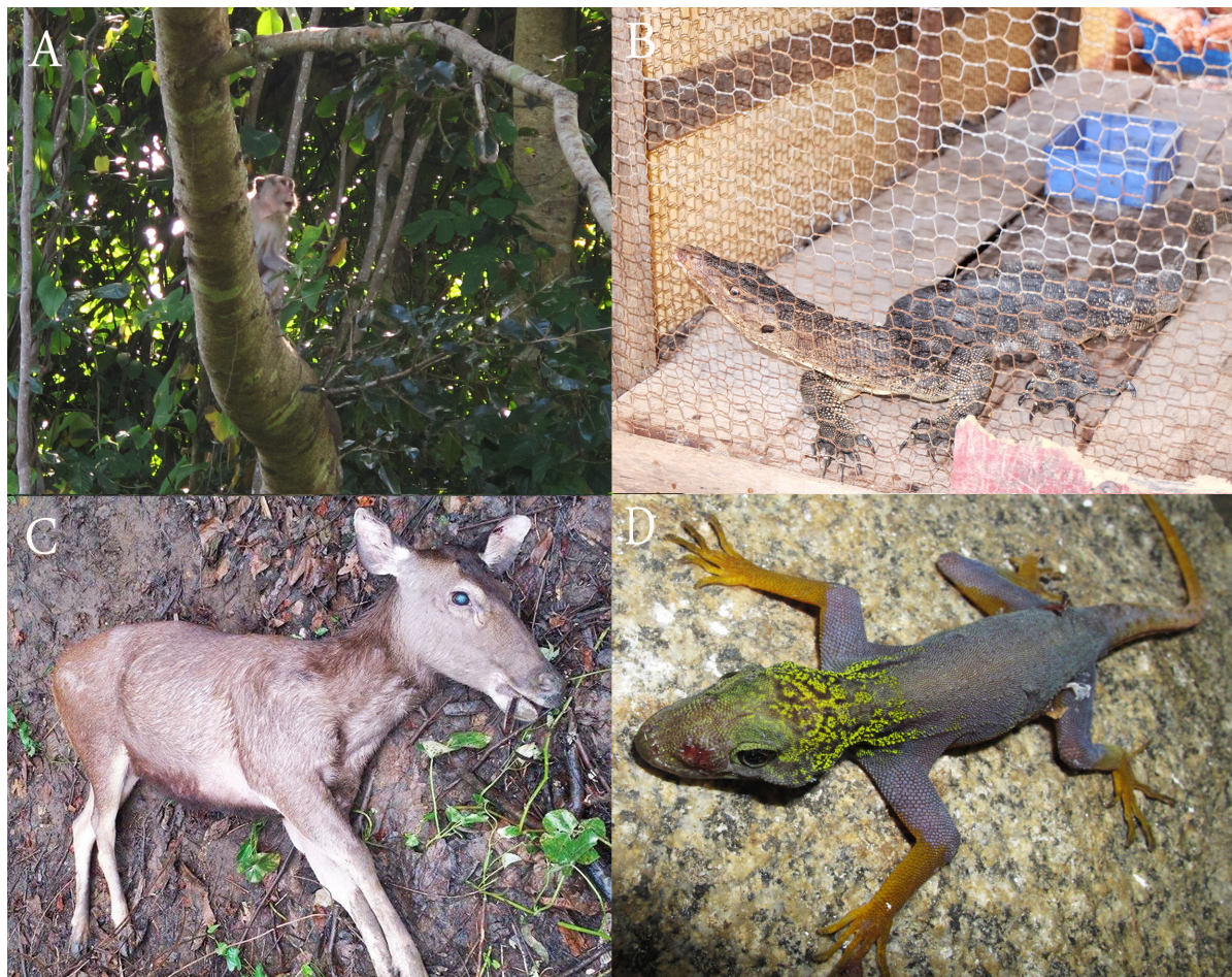
Fig. 5. A. Introduced macaque on Hon Khoai Island; B. Trapped Water Monitor Lizard for consumption; C. Deer killed by blasting of granite outcrops; D. Naturally occurring but injured C. psychedelica .

The present population estimation suggests a stable and actively reproducing population of C. psychedelica at least on Hon Khoai Island. While densities of the species at untouched sites were found to generally have increased from wet to dry season, we observed a decrease of the individual number in the areas, which were most strongly affected by habitat degradation. We assume that the current habitat destruction as well as the planned development of ecotourism will probably interfere with C. psychedelica natural populations, because the species was found to flee hastily in response to the presence of humans. Touristic activities and the presence of humans were already found to negatively affect other range restricted lizards such as Shinisaurus crocodilurus or Goniurosaurus species in northern Vietnam (Ngo et al. 2016; van Schingen et al. 2015). Regarding the small size of Hon Khoai Island, the availability of remaining alternative sites for C. psychedelica is limited. Since the species was only discovered in 2010, long-term population data is lacking and long-term consequences of habitat alteration are not yet investigated in detail.