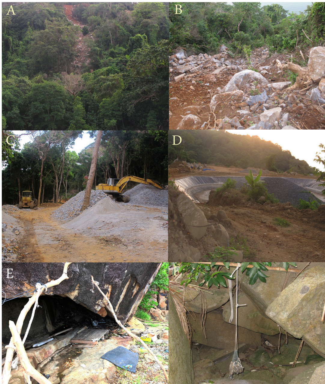
Fig. 4. Potential threats to Cnemaspis psychedelica . A. Erosion caused by opening of new ways; B. Forest opening and blasting of granite karst formations; C. Building of new roads; D. Building of artificial ponds to store freshwater; E. Camp of a fisherman living on the island; F. Trap for Monitor lizards.

to the island is generally prohibited (e.g., Altherr 2014; Auliya et al. 2016; Nguyen et al. 2015).