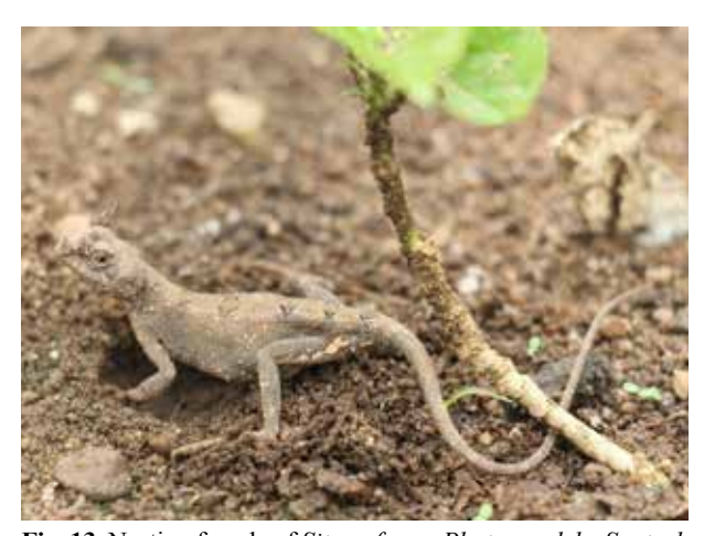
Fig. 13. Nesting female of Sitana fusca.

Sitana fusca (Schleich and Kästle 1998): This species was described from Bardibas, Mahottari district, Nepal ca. 100 km east of Parsa National Park. This is the first record of Sitana from Parsa National Park. This species was frequently observed at NTNC-Parsa Conservation Program office complex, Bhedaha Khola, and Darau Khola. In June 2016, a gravid female was observed nesting in the office complex, and two hatchlings of same species were encountered in August 2016 (Fig. 13).