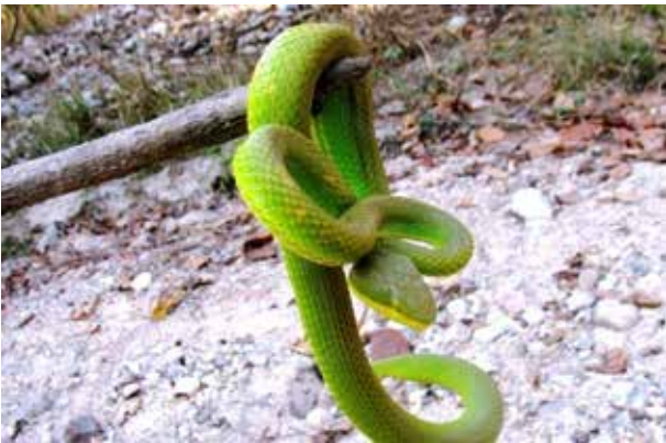
Fig. 38. Trimeresurus albolabris.

Trimeresurus albolabris (Gray 1842): Two individuals were observed at Kamini Daha in March 2014 and June 2015. The third individual was observed from Ramauli-Pratapur in December 2016 (Fig. 38).