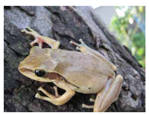
Fig. 10. Polypedates maculatus.

Polypedates maculatus (Gray 1830): Calling males were frequently observed at NTNC-Parsa Conservation Program office complex during the monsoon. This species was frequently observed on the office window and in the bathroom (Fig. 10).