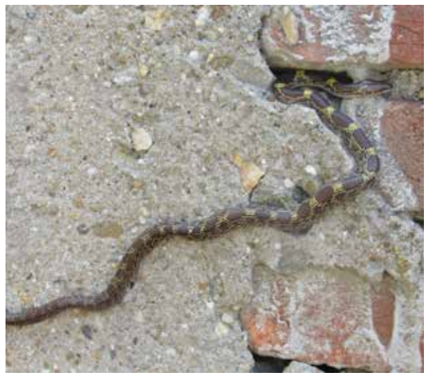
Fig. 25. Lycodon aulicus.

Lycodon aulicus (Linnaeus 1758): Observed at NTNC-Parsa Conservation Program Office complex, and dead individuals were found at Amlekhgunj-Hattisar. A basking individual was frequently observed in a crevice of a cemented water tank (Fig. 25). This is the first record from Parsa National Park.