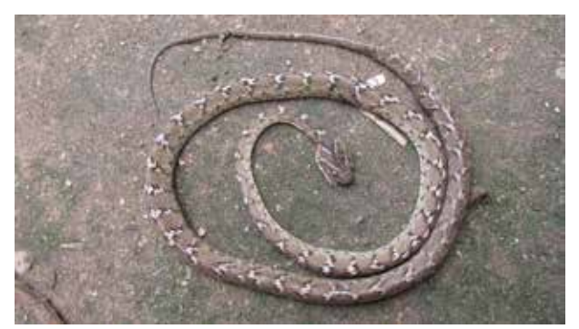
Fig. 22. Boiga trigonata.

Coelognathus radiatus (Boie 1827): Dead specimens were found near human habitation, and an individual was recorded at Kamini Daha. In May and June, the species is frequently observed in buffer villages of the park, and people kill the snakes when they encounter them.