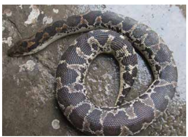
Fig. 20. Eryx conicus.

Eryx conicus (Schneider 1801): This species was encountered at Amlekhgunj-Hattisar (Fig. 20).