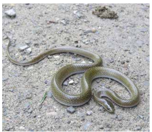
Fig. 26. Lycodon jara.

Lycodon jara (Shaw 1802): Observed at Amlekhgunj-Hattisar. According to Schleich and Kästle (2002), it is a rarely found species from Terai Nepal. However, there are published reports of it in bordering states of India as well. This is the first record from Parsa National Park (Fig. 26).