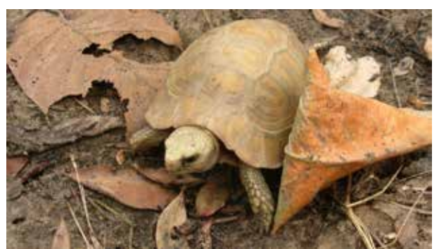
Fig. 39. Indotestudo elongata.

Indotestudo elongata (Blyth 1854): An individual was observed at Ghodemasan. Two rescued individuals were kept at Amlekhgunj-Hattisar. Later, they were released inside the park. Local people, especially business people, like to keep turtles and tortoises in captivity believing they are a sign of good luck for their business (Fig. 39).