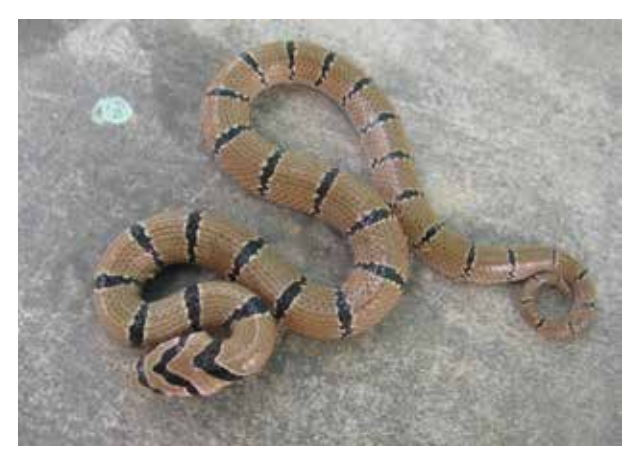
Fig. 27. Oligodon arnensis.

Oligodon arnensis (Shaw 1802): Observed from Amlekhgunj-Hattisar and NTNC-Parsa Conservation Office Complex (Fig. 27). This species is also frequently observed in Chitwan National Park.