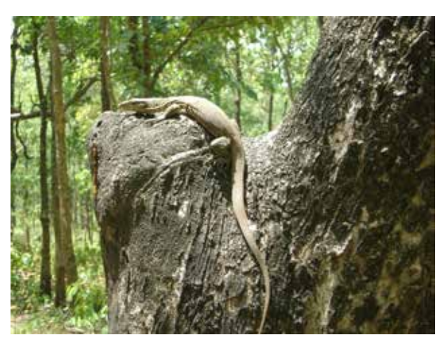
Fig. 19. Varanus bengalensis.

Varanus bengalensis (Daudin 1802): Individuals were observed at Kamini Daha, Masine area, Bhata, Adhabhar-PNP office, Bhedaha Khola, Shitalpur, and Ramauli-Pratapur. They were frequently observed at human habitations at Amlekhgunj, and one adult was rescued from the Nepal Oil Corporation's office complex. The species is frequently seen in holes of the Sal (Shorea robusta) trees lying on the ground and on standing trees (Fig. 19).