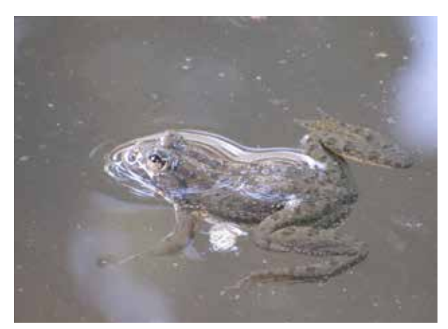
Fig. 4. Euphlyctis cyanophlyctis.

Fejarvarya syhadrensis (Annandale 1919): The individuals we recorded had no mid dorsal line with reddish orange patches which is characteristic of this species (Schleich and Kästle 2002). We recorded this species along marshy lands in the ponds inside the park.