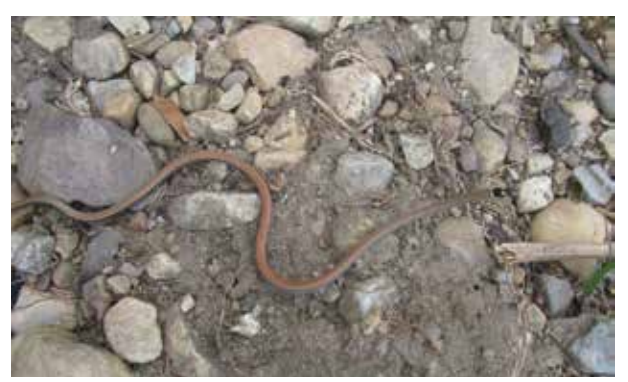
Fig. 30. Sibynophis sagittarius.

Sibynophis sagittarius (Cantor 1839): A specimen was found at Ghodemasan area basking on a riverbed (Fig. 30).