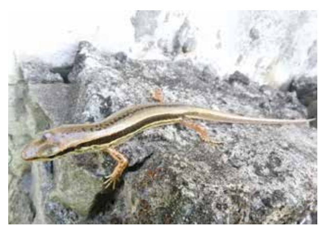
Fig. 18. Sphenomorphus maculatus.

Sphenomorphus maculatus (Blyth 1853): This species was frequently observed in the foothills of Siwaliks inside the park and found basking on the rocks of dry river beds (Fig. 18). This is the first record for Parsa National Park.