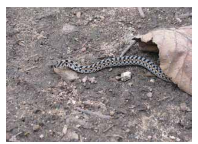
Fig. 34. Amphiesma stolatum.

Xenochrophis piscator (Schneider 1799): The species was frequently observed in human habitation and a specimen was seen in the Bhata wetland (Fig. 35).