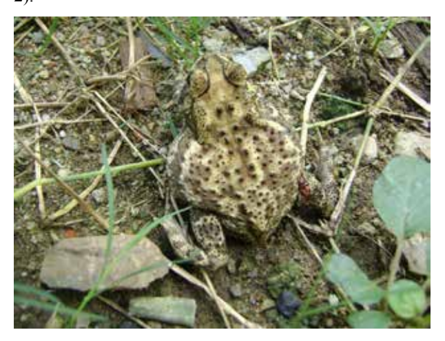
Fig. 2. Duttaphrynus melanostictus.

species were frequently observed in the east-west national highway between Amlekhgunj and Adhabhar segment. This is the most common bufonid in Terai, Nepal (Fig. 2).