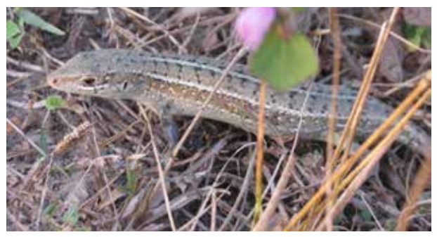
Fig. 15. Eutropis dissimillis.

Eutropis dissimilis (Hallowell 1857): Recorded from Amlekhgunj-Hattisar, Sikaribaas basking during winter. This species is rarely seen compared to its congenerics in Parsa National Park (Fig. 15).