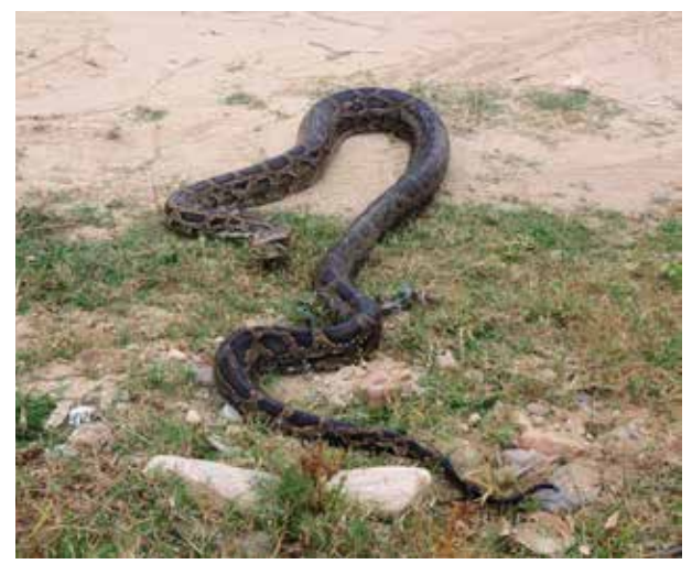
Fig. 21. Python bivittatus.

Python bivittatus (Kuhl 1820): The python is the largest snake species in Nepal and it is distributed from Nepalese Terai up to 2,800 m elevation in Nepal (Bhattarai et al. 2017). In the PNP, the species was observed from Bhata, Amlekhgunj-Hattisar, Halkhoria Daha, and Ramauli Pratapur (Fig. 21). The PNP has dry sub-tropical habitat and gets incidental fire. One injured python was found with wounds inside the park at Kamini Daha.