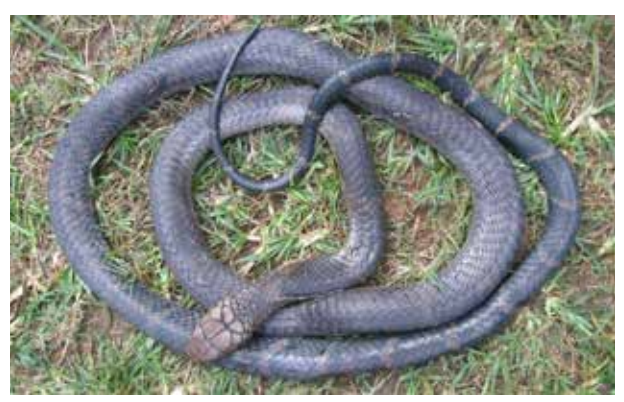
Fig. 33. Ophiophagus hannah.

Ophiophagus hannah (Cantor 1836): A dead specimen was recorded at Amlekhgunj-Hattisar. Another individual was observed at Shitalpur camp in November 2016. (Fig. 33).