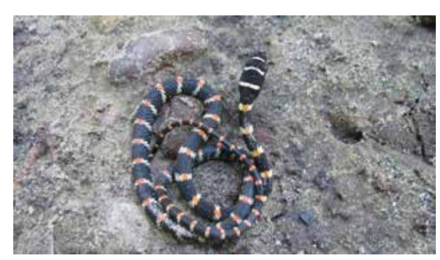
Fig. 23. Chrysopelea ornata. Photograph by Kapil Pokharel/NTNC-BCC.

Chrysopelea ornata (Shaw 1802): A juvenile individual was observed at Shikaribas Khola, and a dead specimen was found at Amlekhgunj-Hattisar (Fig. 23). This is the first record from Parsa National Park.