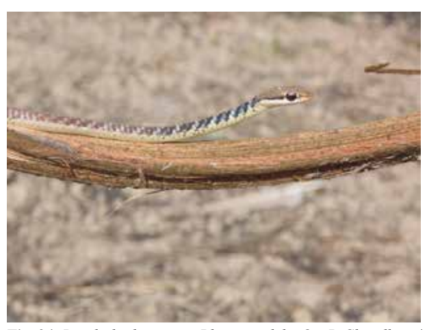
Fig. 24. Dendrelaphis tristis.

Dendrelaphis tristis (Daudin 1803): The basking individuals were encountered at Amlekhgunj-Hattisar, Bhata-Hattisar, and Ghodemasan (Fig. 24). This is the first record from Parsa National Park.