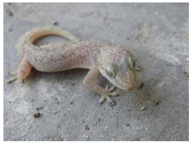
Fig. 11. Hemidactylus brookii.

Hemidactylus cf. brookii (Gray 1845): Individuals with strongly keeled dorsal tubercles and tails with spines were recorded. Schleich and Kästle (2002) recorded H. brookii on buildings in Chitwan National Park. However, we recorded them in dead logs inside the park in Parsa National Park (Fig. 11). This species is regarded as a species complex and has been proposed for detailed molecular studies to solve taxonomy of Nepalese populations (Rösler and Glaw 2010; Kathriner et al. 2014).