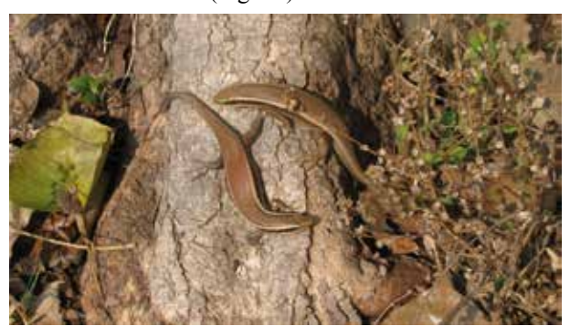
Fig. 14. Eutropis carinata.