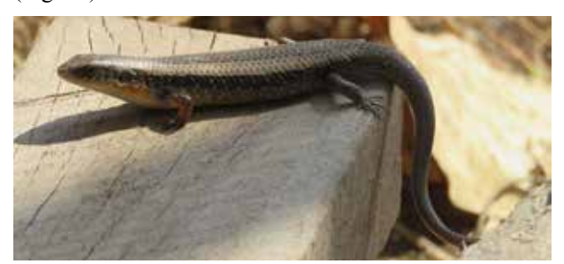
Fig. 16. Eutropis macularia. Photograph by Binod Darai/NTNC-BCC.

Eutropis macularia (Blyth 1853): Observed from Kamini Daha, Amlekhgunj-Hattisar, Bhata, Nirmalbasti, Ramauli Pratappur, Mahadev Khola, and Ghode Masan (Fig. 16).