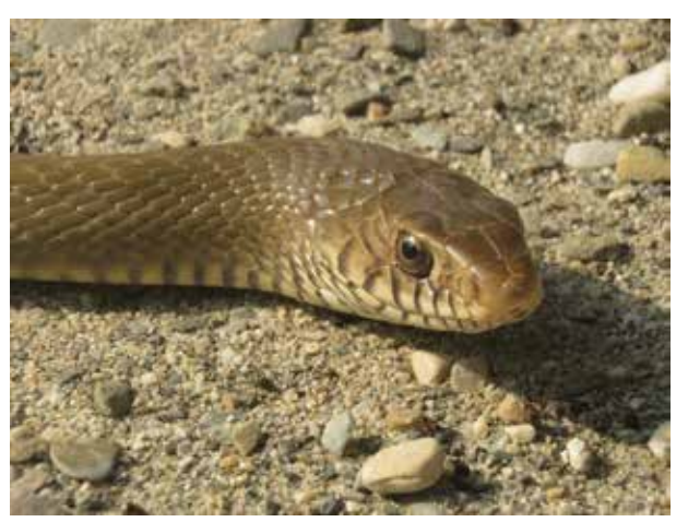
Fig. 29. Ptyas mucosa.

Ptyas mucosa (Linnaeus 1758): Animals in combat were observed on 7 June, 2016. A road-killed specimen in the segment between Amlekhgunj and Adhabhar was recorded. Individuals were frequently observed at NTNC-Parsa Conservation Office complex (Fig. 29). This report is the first record for Parsa National Park.