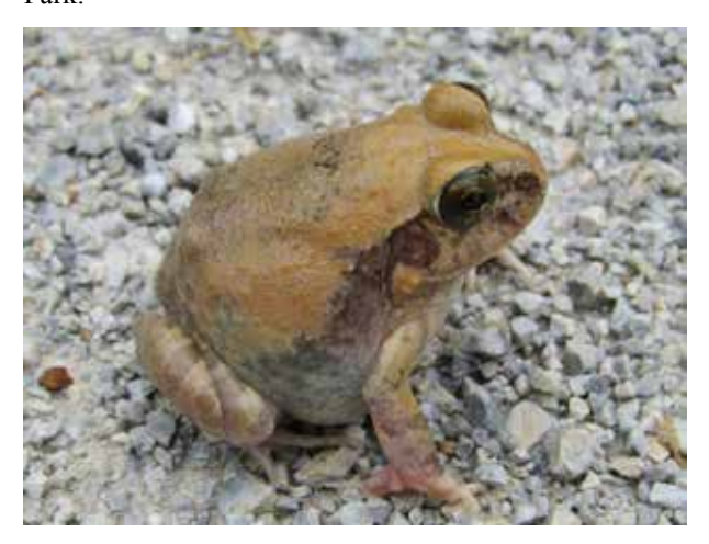
Fig. 6. Sphaerotheca breviceps.

Sphaerotheca breviceps (Schneider 1799): Almost toadlike, stocky with distinct supratympanal fold. We found some specimens in Halkhoria Daha and Amlekhgunj-Hattisar area during June and July and calling males were also observed. This is the first record to Parsa National Park.