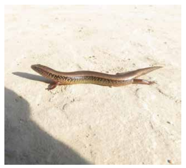
Fig. 17. Lygosoma punctata.

Lygosoma punctata (Gmelin 1799): Observed from Bhata, Adhabhar, Sikaribaas, and Shitalpur (Fig. 17).