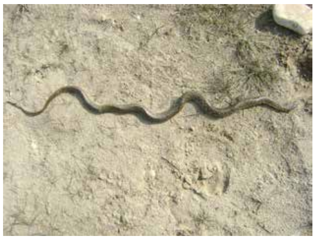
Fig. 35. Xenochropis piscator.

Xenochrophis piscator (Schneider 1799): The species was frequently observed in human habitation and a specimen was seen in the Bhata wetland (Fig. 35).