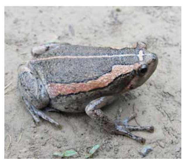
Fig. 9. Uperodon taprobanicus.

Uperodon taprobanicus (Parker 1934): This frog is grayish black, and individuals have reddish-orange dorsolateral irregular bands. Individuals with a mid-dorsal line from snout to vent and with mid-dorsal line were recorded (Fig. 9). Males have folded black vocal sacs and were observed in amplexus. According to Schleich and Kästle (2002), this species is distributed from central to eastern Nepal between 100 and 300 m elevation. Bhattarai et al. (2017a) also recorded this species from Beeshazar and associated lakes, a Ramsar site.