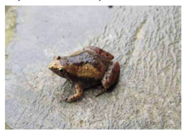
Fig. 7. Microhyla cf. nilphamariensis.

Microhyla cf. nilphamariensis (Howlader, Nair, Gopalan, and Merila 2015): The type locality of this frog is Koya Golahut, Saidpur, Nilphamari, Bangladesh. Recently, Khatiwada et al. (2017) recorded it from central and eastern Nepal and proposed the Chitwan population to be M. nilphamarariensis based on molecular and call records. We believe the Parsa population to be M. nilphamariensis (Fig. 7). However, only detailed molecular study will resolve its taxonomy.