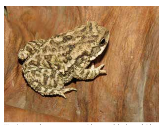
Fig. 3. Duttaphrynus stomaticus.

individuals can be distinguished from D. melanostictus by absence of canthal black ridge and smaller tympanum.