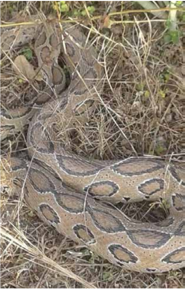
Fig. 37. Daboia russelii.

Daboia russelii (Shaw and Nodder 1797): A single individual was observed from Bhata on the way to Rambhori grassland. The individual was basking near a gabion wall (Fig. 37).