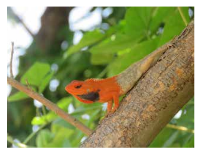
Fig. 12. Calotes versicolor.

Calotes versicolor (Daudin 1802): This is the most common diurnal agamid distributed from below 100 m to 3,200 m in Nepal (Schleich and Kästle 2002). The species was frequently observed in and out of the park boundary (Fig. 12).