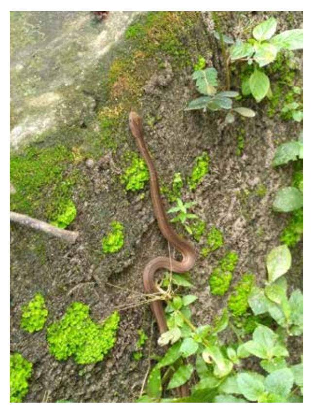
Fig. 28. Psammodynastes pulverulentus. photograph taken at Triveni, Chitwan National Park.

Psammodynastes pulverulentus (Boie 1827): According to Schleich and Kästle (2002), the records of the species were from Butwal, western Nepal, and Khotang, Udaypur, and Ilam from eastern Nepal. Recently, Bhattarai et al. (2017) reported it from Ratomate-Harda Khola, Chitwan National Park. Later the species was also observed at Triveni area of Chitwan National Park. In the PNP, the species was observed at Ghodemasan area, being the first record from the PNP (Fig. 28).