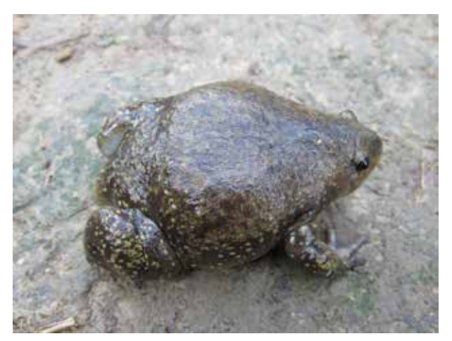
Fig. 8. Uperodon globulosus.

Uperodon taprobanicus (Parker 1934): This frog is grayish black, and individuals have reddish-orange dorsolateral irregular bands. Individuals with a mid-dorsal line from snout to vent and with mid-dorsal line were recorded (Fig. 9). Males have folded black vocal sacs and were observed in amplexus. According to Schleich and Kästle (2002), this species is distributed from central to eastern Nepal between 100 and 300 m elevation. Bhattarai et al. (2017a) also recorded this species from Beeshazar and associated lakes, a Ramsar site.