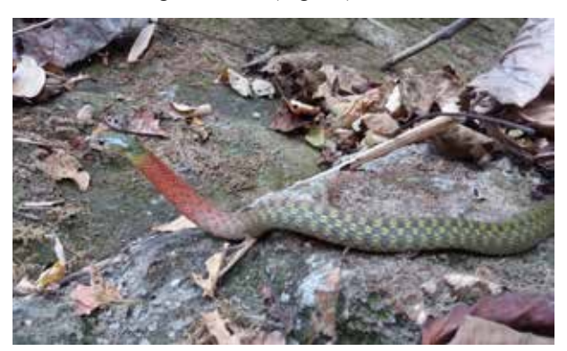
Fig. 36. Rhabdophis subminiatus.

Rhabdophis subminiatus (Schlegel 1837): Record of this species was previously not reported from the PNP. Schleich and Kästle (2002) reported it from the Chitwan National Park. The specimen was recorded at Ghodemasan area basking on a rock (Fig. 36) in November 2016.