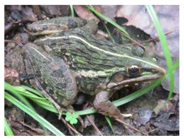
Fig. 5. Hoplobatrachus tigerinus.

Hoplobatrachus tigerinus (Daudin 1802): This is the largest frog of Terai region. Yellow colored breeding males were frequently observed in puddles during monsoon (Fig. 5).