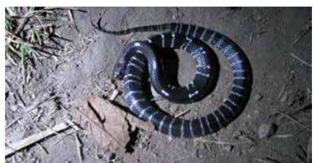
Fig. 31. Bungarus caeruleus.

Bungarus caeruleus (Schneider 1801): Specimens observed at Amlekhgunj-Hattisar. Killed specimens were found near human habitation (Fig. 31).