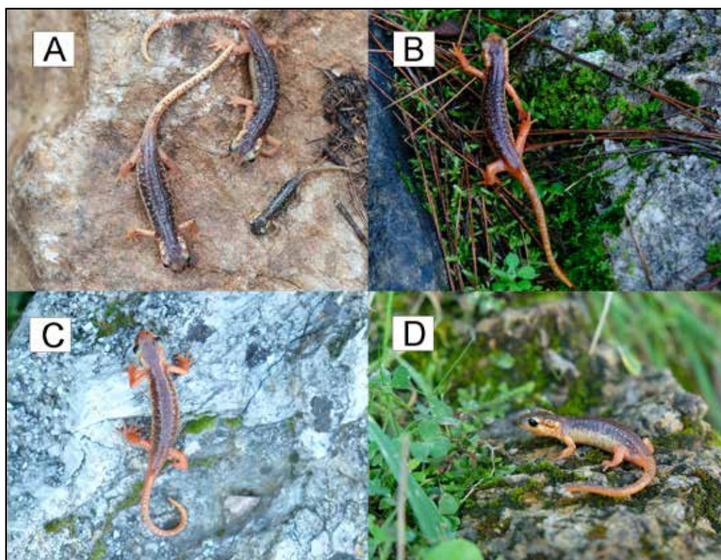
Fig. 3. Specimens from new sites. A. the right-side female, the middle male, left side juvenile from Arıcılar [1]; B. A male from Turunç [2]; C. A male from Selimiye [4] D. A juvenile from Söğütköy [5].

this situation with three new recognized species ( L. irfani , L. arikani , and L. yehudahi ) (Göçmen et al. 2011; Göçmen and Akman 2012) being changed to subspecies of L. billae (Veith et al. 2016) over the last six years. The species has also suffered due to scientific collection for taxonomic studies and the pet trade, reducing population sizes (UNEP-WCMC 2008). We hope that future faunal and taxonomic studies on Lycian salamanders will be designed to involve low/no specimen collections. All