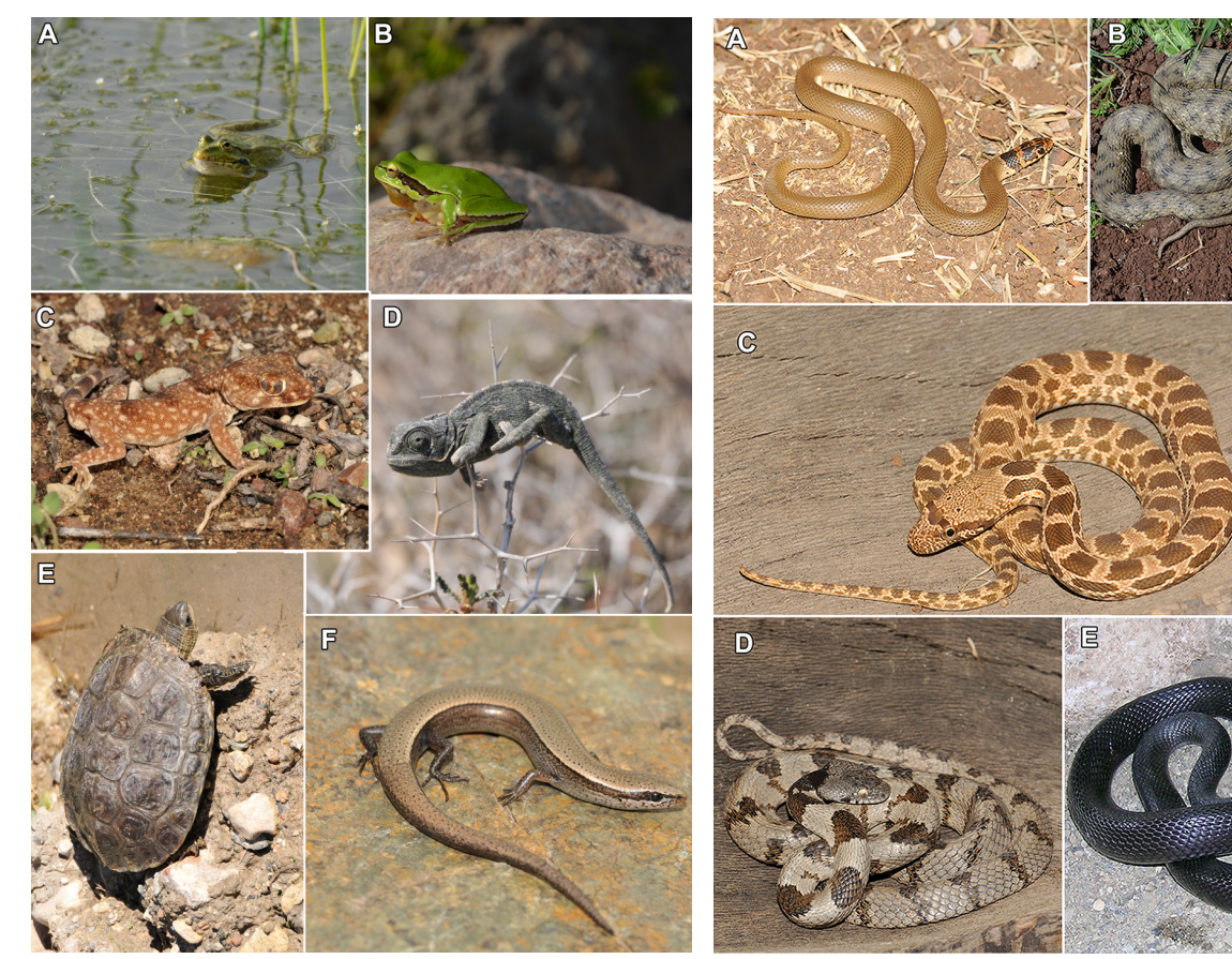
Fig. 2. Some representative amphibians and reptiles from the province of Kilis. (A) Pelophylax bedriagae , (B) Hyla savignyi , (C) Stenodactylus grandiceps , (D) Chamaeleo chamaeleon , (E) Mauremys rivulata , (F) Ablepharus budaki .