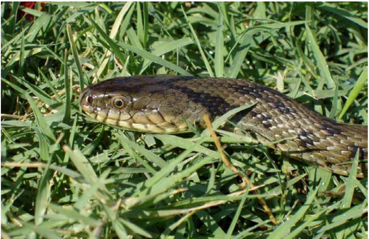
Figure 2. Natrix tessellata , Déversoir, 24 May 2008.