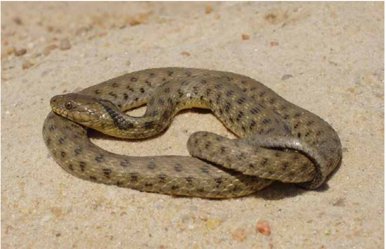
Figure 1. Natrix tessellata , Ismailia city, 7 August 2007.